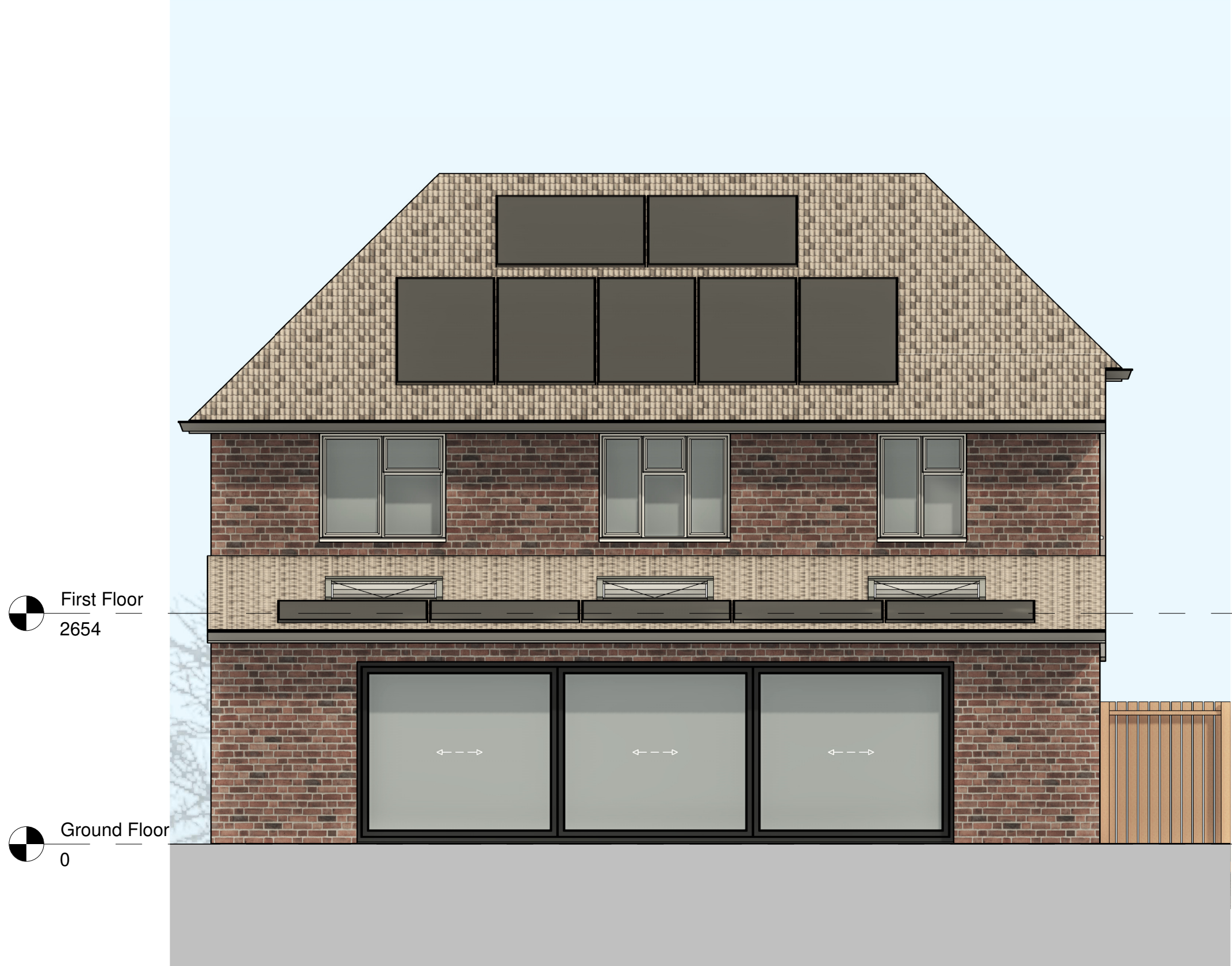
Rear Elevation 1 : 50