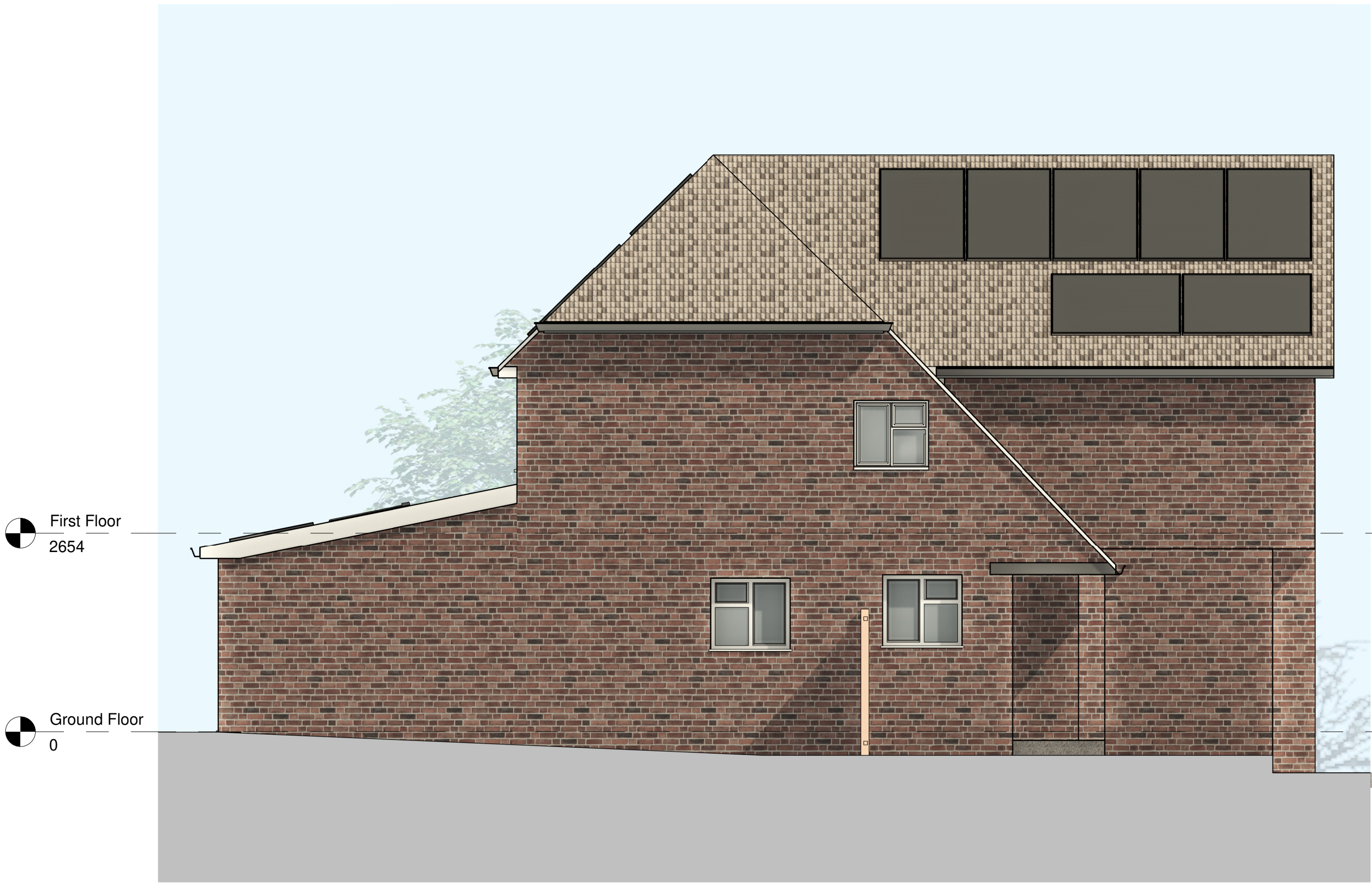
Left Elevation 1 : 50

This drawing is protected under copyright