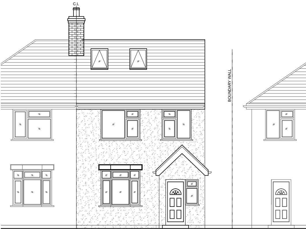
01 - FRONT ELEVATION