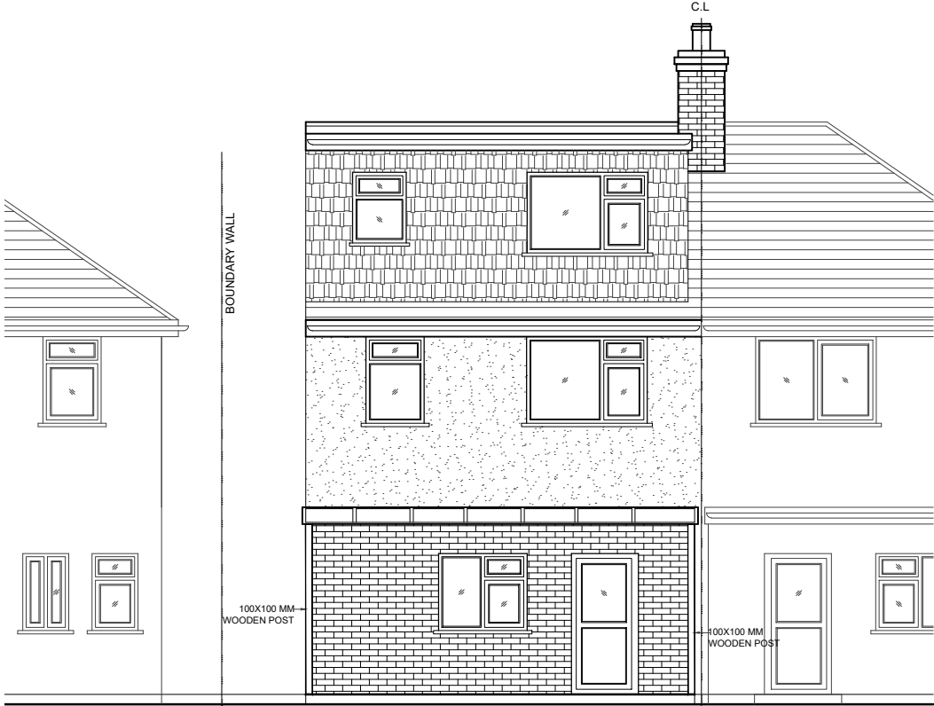
02 - REAR ELEVATION