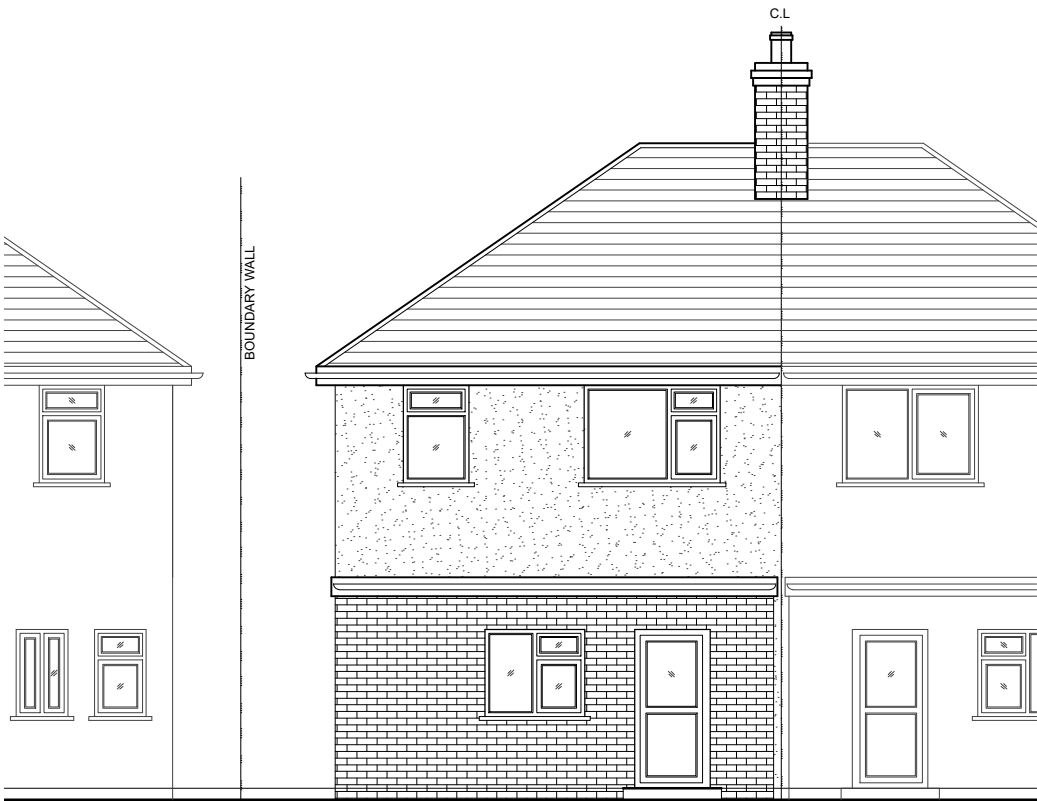
04 - REAR ELEVATION