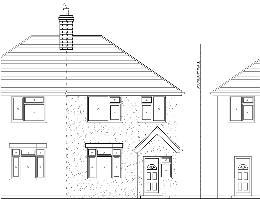
05 - FRONT ELEVATION