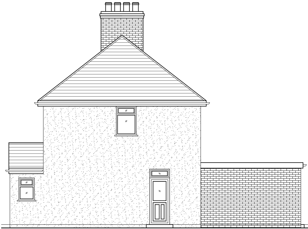
03 - SIDE ELEVATION