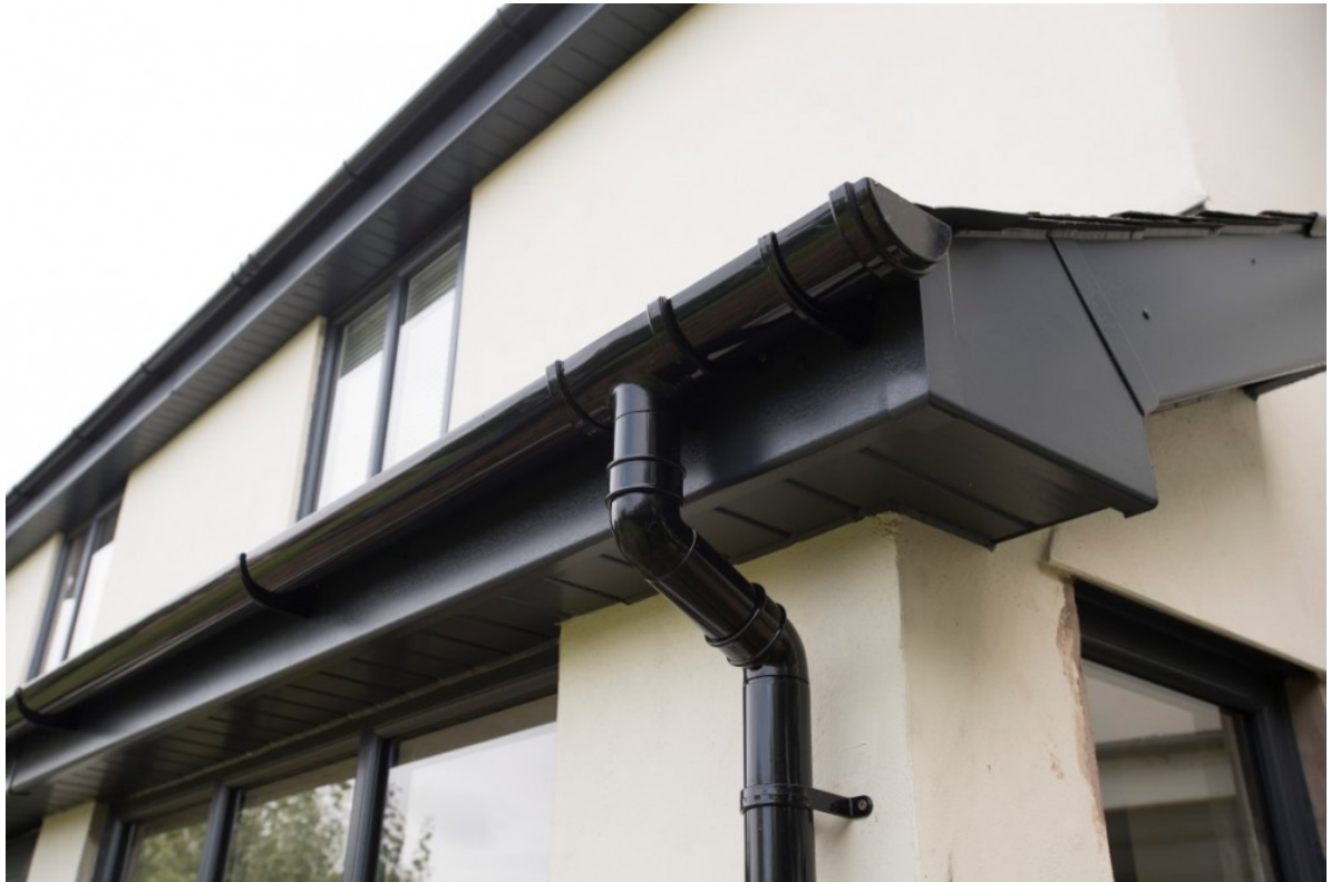
Figure 6 (Black plastic gutter, fascia and down pipe)

The external gutter, fascia down pipe and all rainwater goods proposed to be used are black plastic. Figure 6 below shows the finish of these products. Please see elevation drawing for where door is proposed to be used.