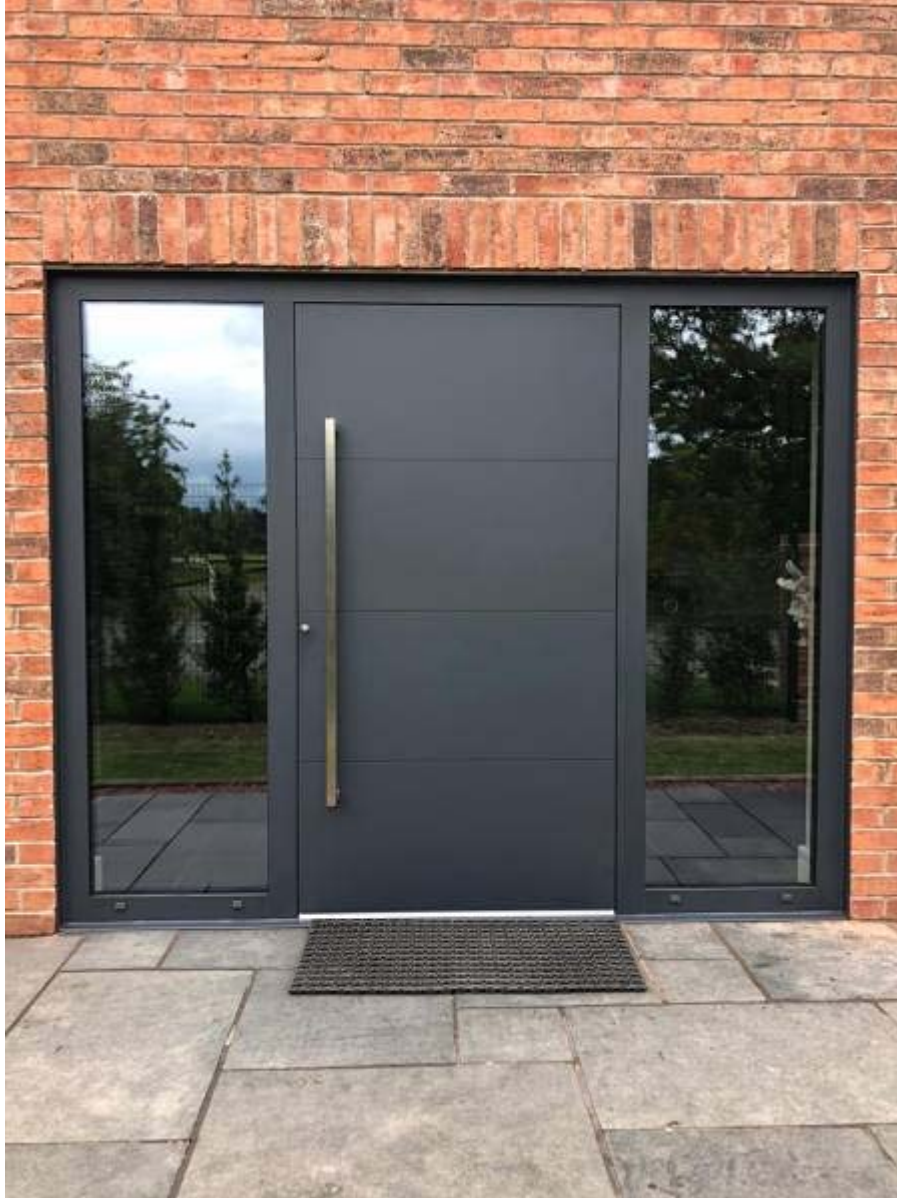
Figure 5 (Dark grey aluminium doors)

The external door proposed to be used are dark grey aluminium. Figure 5 below shows finish of the door. Please see elevation drawing for where door is proposed to be used.