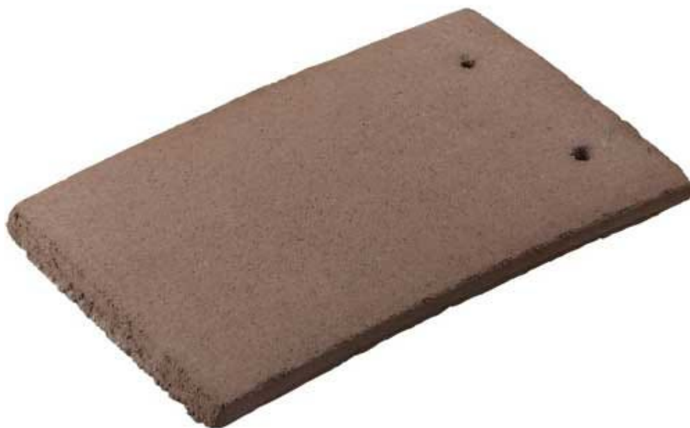
Figure 3 (Redland concrete plan tile tudor brown)