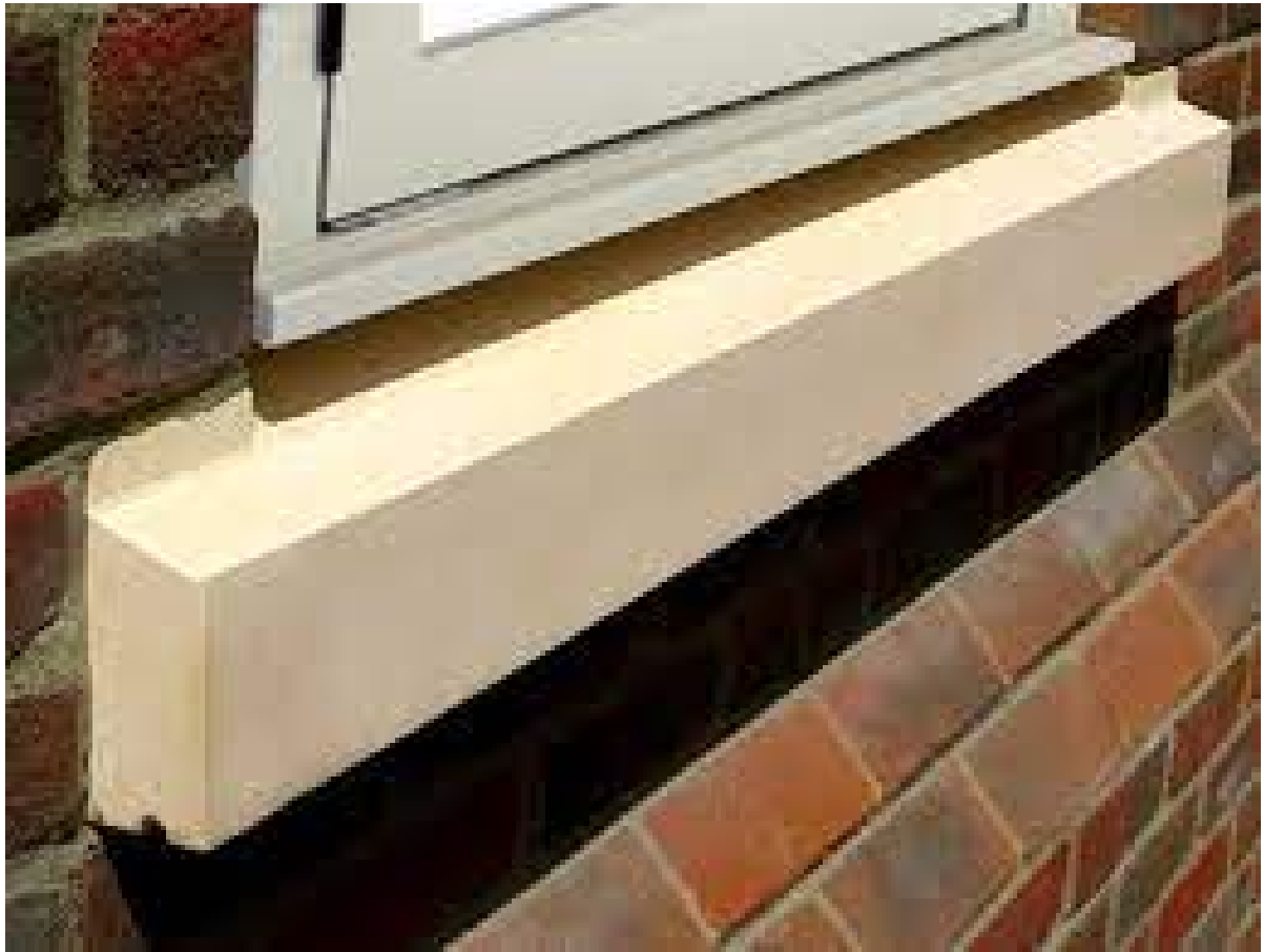
Figure 7 (Cill stone natural colour)

A stone cill is proposed to be used under the windows externally in the brick work the stone is proposed to be a natural stone in colour. Figure 7 below shows the finish of these products. Please see elevation drawing for where door is proposed to be used.