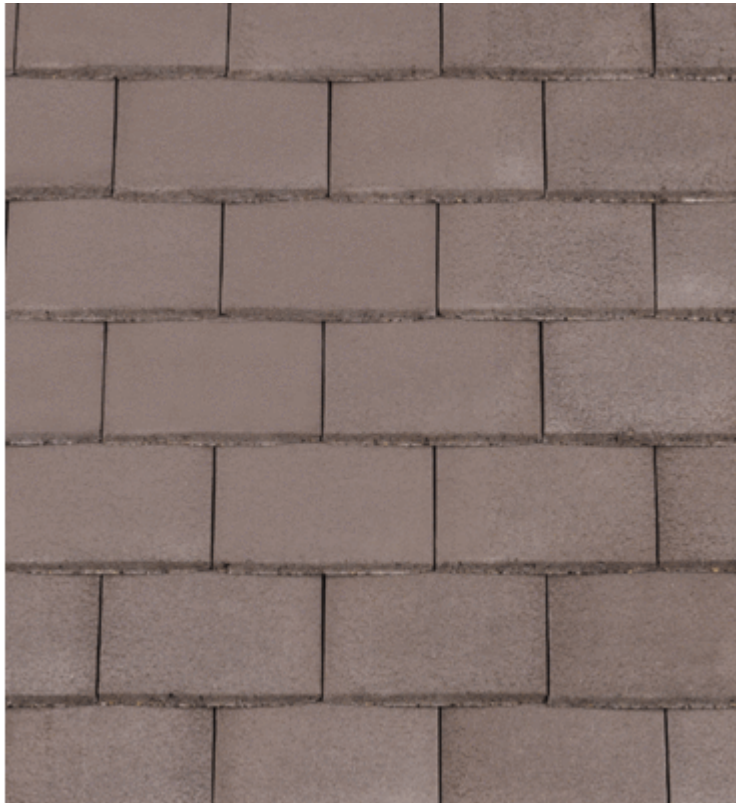
Figure 2 (Redland concrete plan tile tudor brown)

The external roof tiles proposed to be used are Marley Thrutone Fibre Cement Slates Blue Black Figure 2 below shows the finish of the tile. Please see elevation drawing for where tile is proposed to be used.