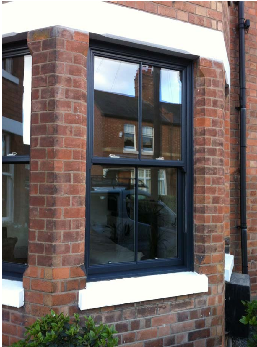
Figure 4 (Dark grey aluminium Georgian windows)

The external windows proposed to be used are dark grey aluminium Georgian style window. Figure 4 below shows the finish of windows. Please see elevation drawing for where windows are proposed to be used.