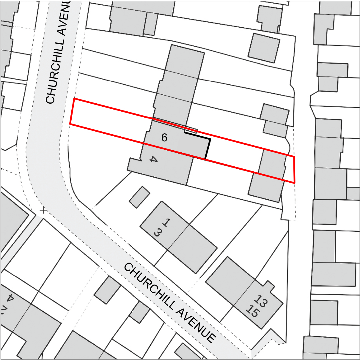
02 BLOCK PLAN SCALE 1:500