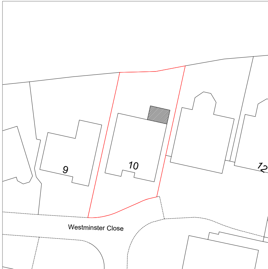
Proposed Block Plan