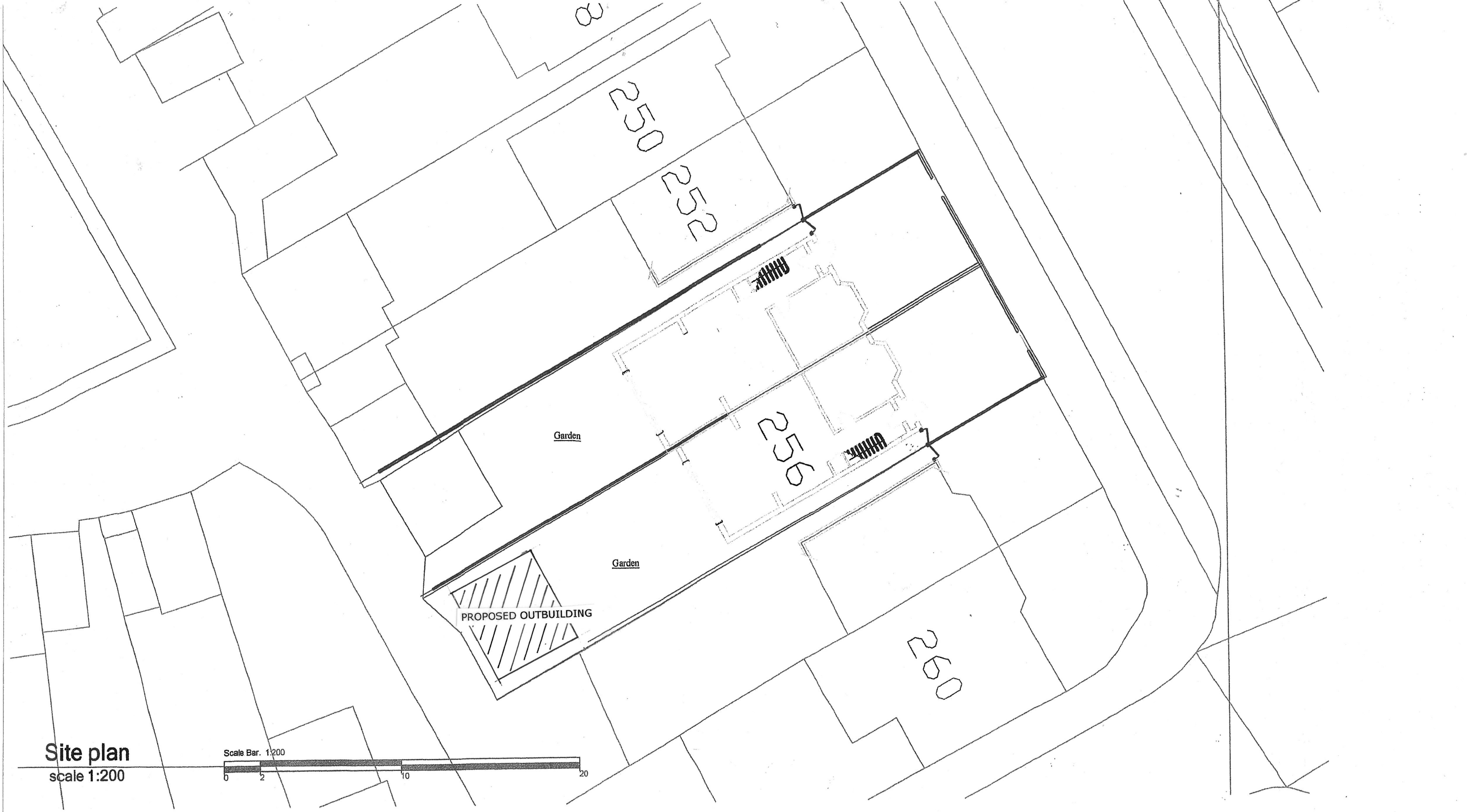
Site plan scale 1:200