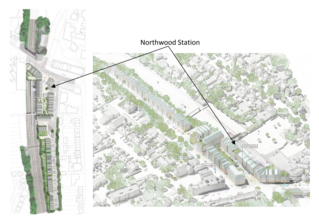
Figure 1.2 Conceptual Development Proposals and Artist Impression of TfL Vision