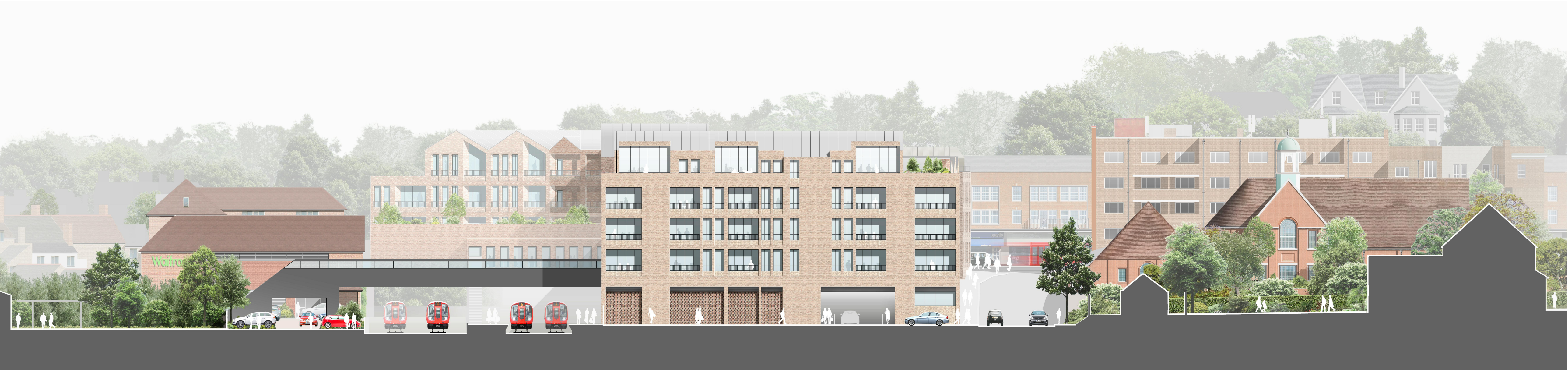
1 ELEVATION AA SCALE 1:250@A1 [Illustrative material - No dimensions to be taken from these drawings]