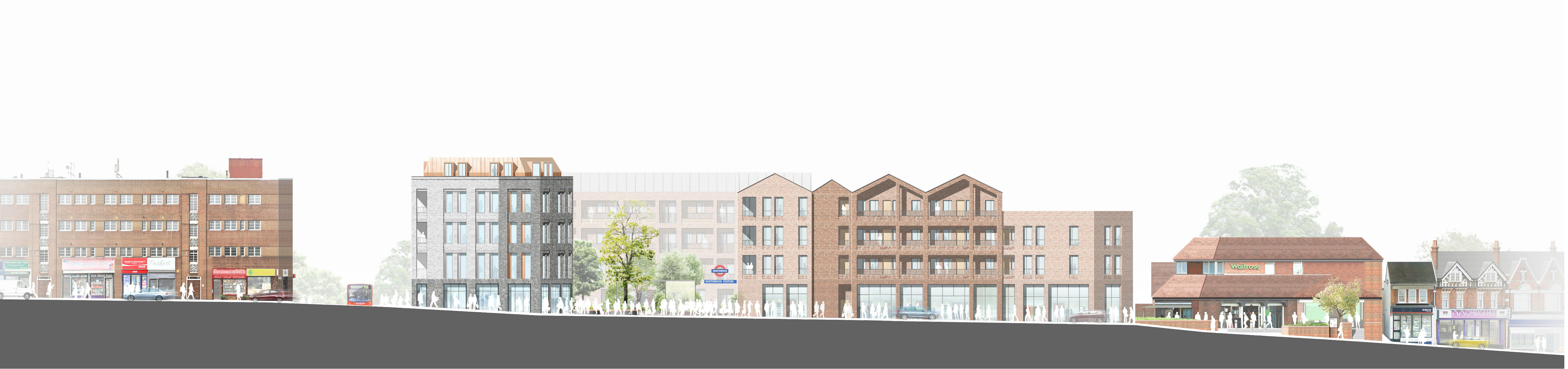
2 ELEVATION GG SCALE 1:250@A1 [Illustrative material - No dimensions to be taken from these drawings]