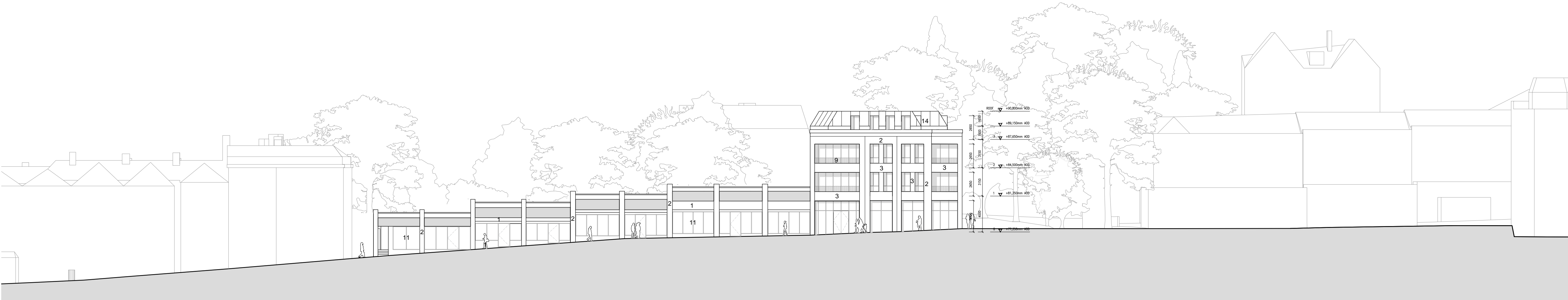
ELEVATION HH 2 SCALE 1:250@A1