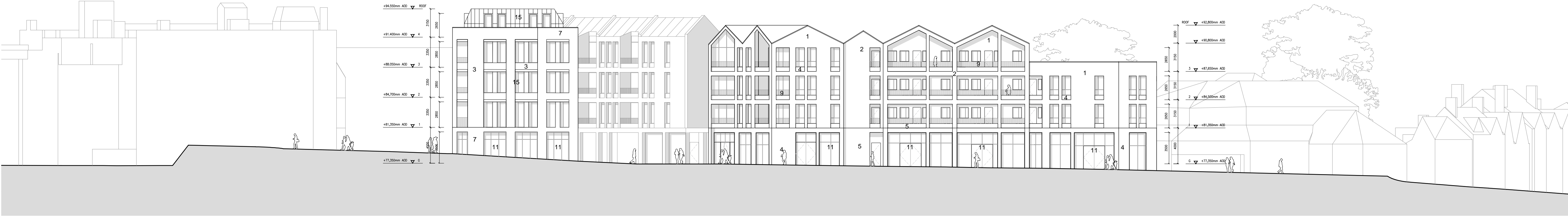
ELEVATION GG 1 SCALE 1:250@A1