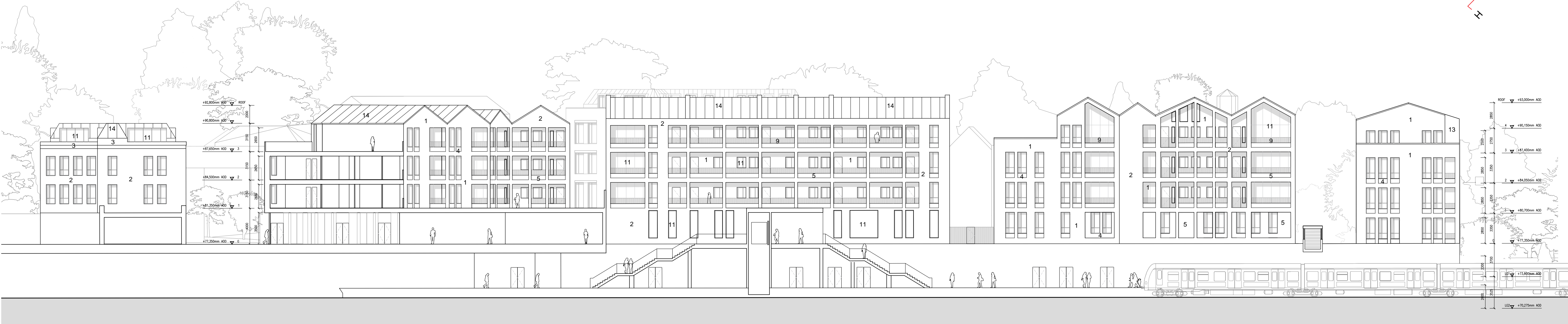
ELEVATION II 3 SCALE 1:250@A1

NOTES Fletcher Priest Architects is a Limited Liability Partnership registered in England and Wales (OC336568) at the below address. ≡ this drawing is to be read in conjunction with the design risk assessment prepared by fpa. ≡ this drawing is to be read in conjunction with other drawings and specification produced by fpa and other members of the design team. ≡ all dimensions are in millimeters unless otherwise stated. ≡ do not scale this drawing. ≡ any discrepancies in dimensions are to be reported to the architect. ≡ all information subject to detail site survey.