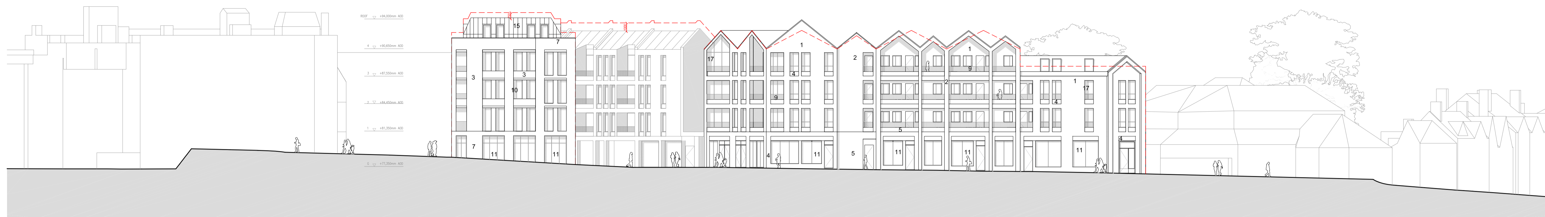
1 ELEVATION GG SCALE 1:250@A1

Existing station platforms to remain. Not included as part of design proposals.