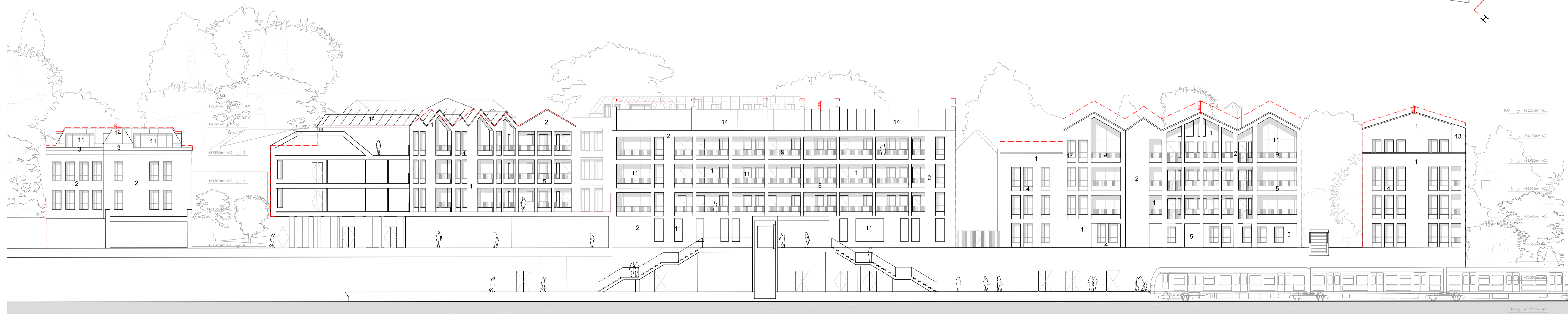
3 ELEVATION II SCALE 1:250@A1