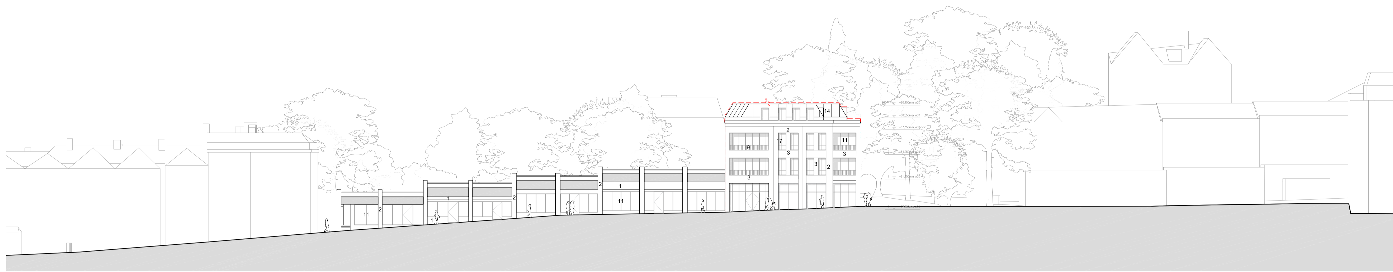
2 ELEVATION HH SCALE 1:250@A1