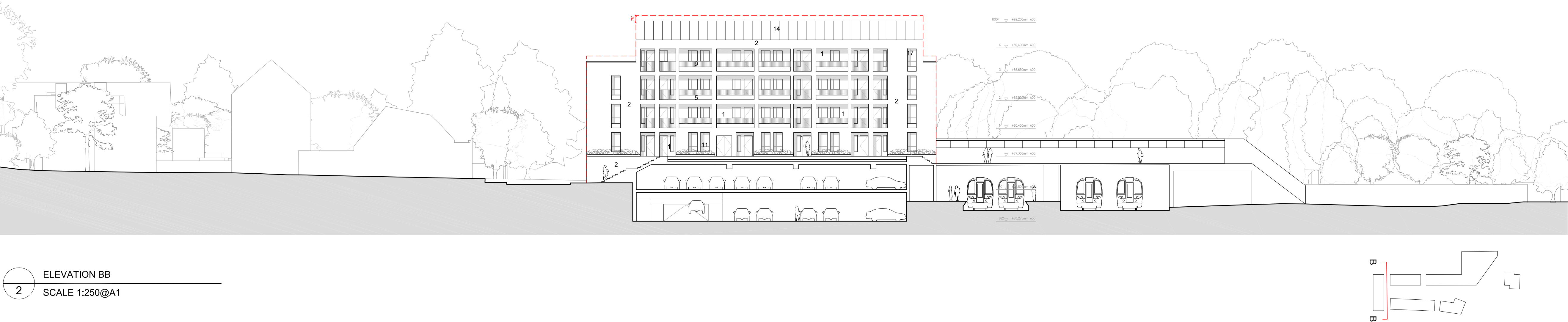
ELEVATION BB 2 SCALE 1:250@A1