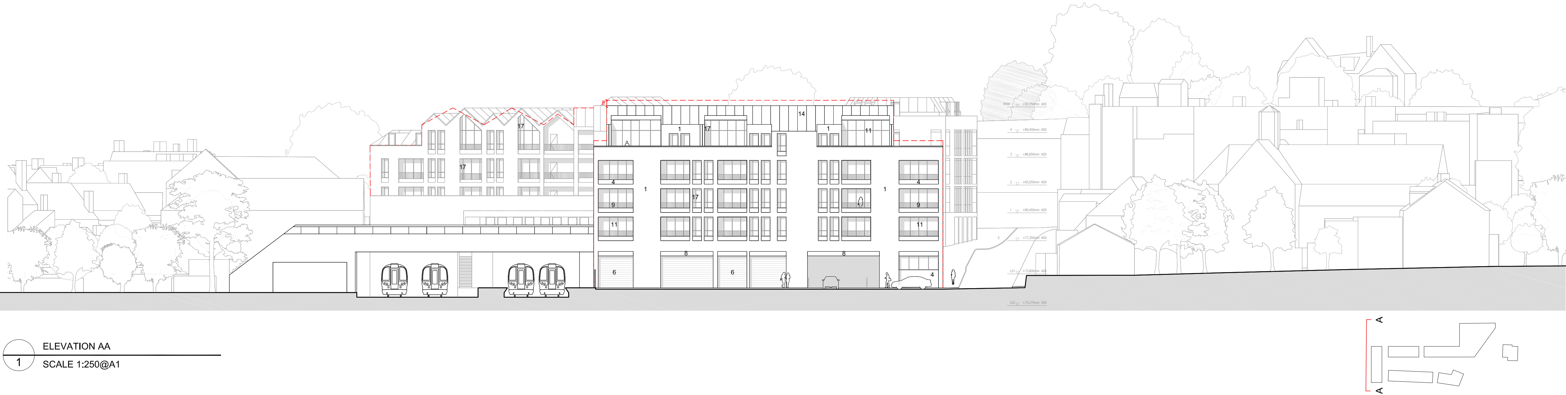
ELEVATION AA 1 SCALE 1:250@A1

middlessex house 34/42 cleveland st london W11 4JE t +44 (0)20 7034 2200 f +44 (0)20 7637 5347 www.fletcherpriest.com