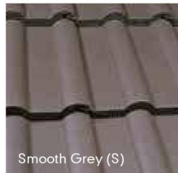
Smooth Grey (S)