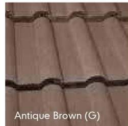
Antique Brown (G)