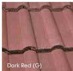
Dark Red (G)