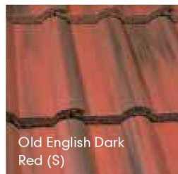
Old English Dark Red (S)