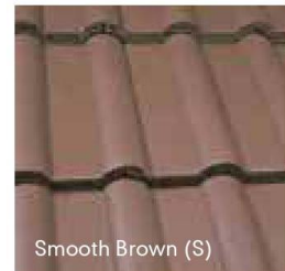
Smooth Brown (S)