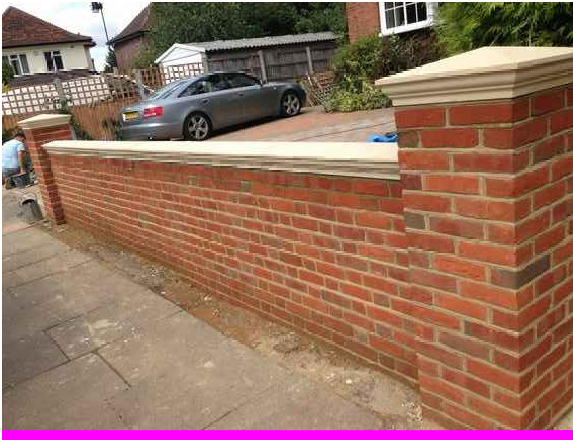
Proposed low-level brick fence