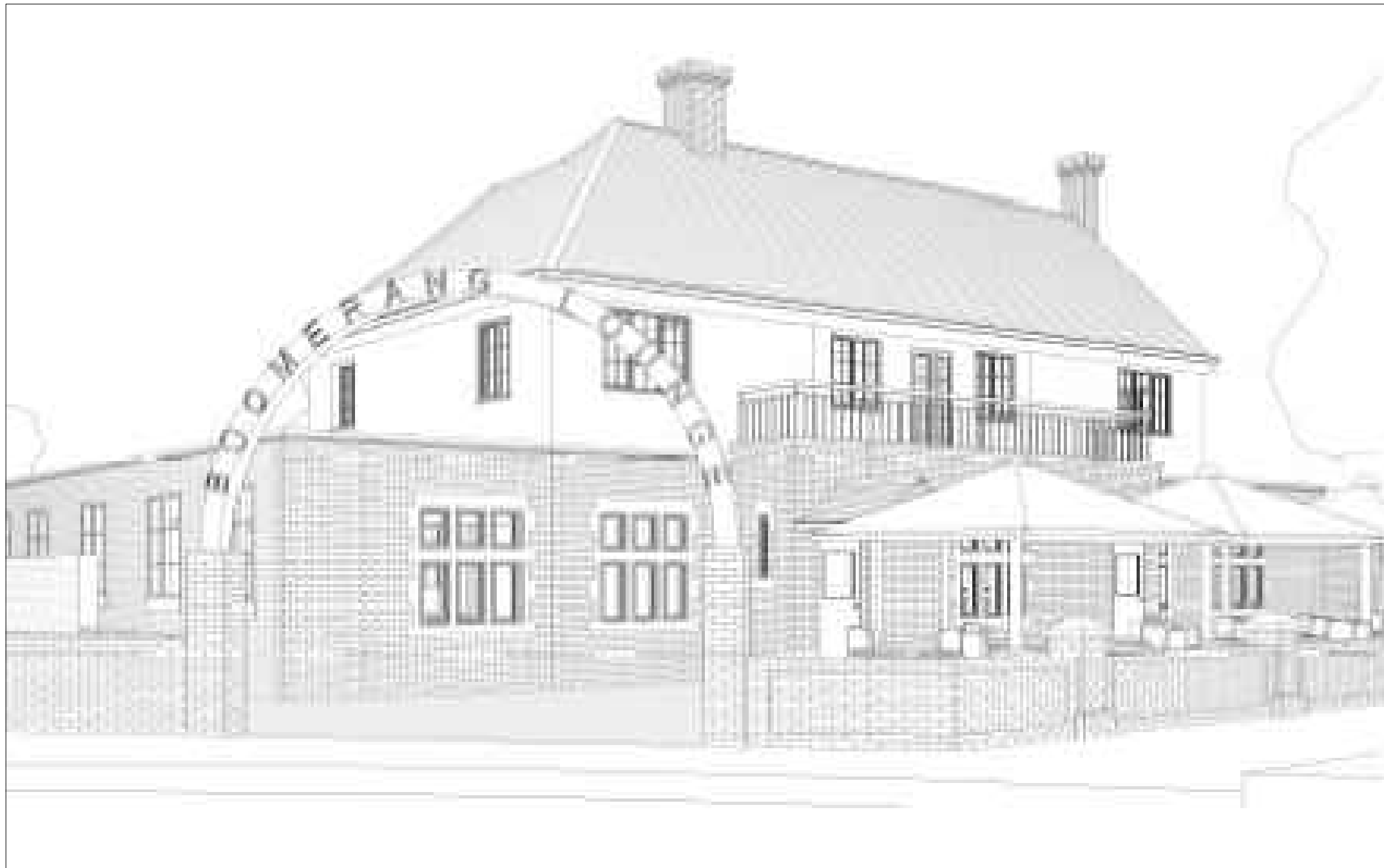
Proposed arch above the entrance