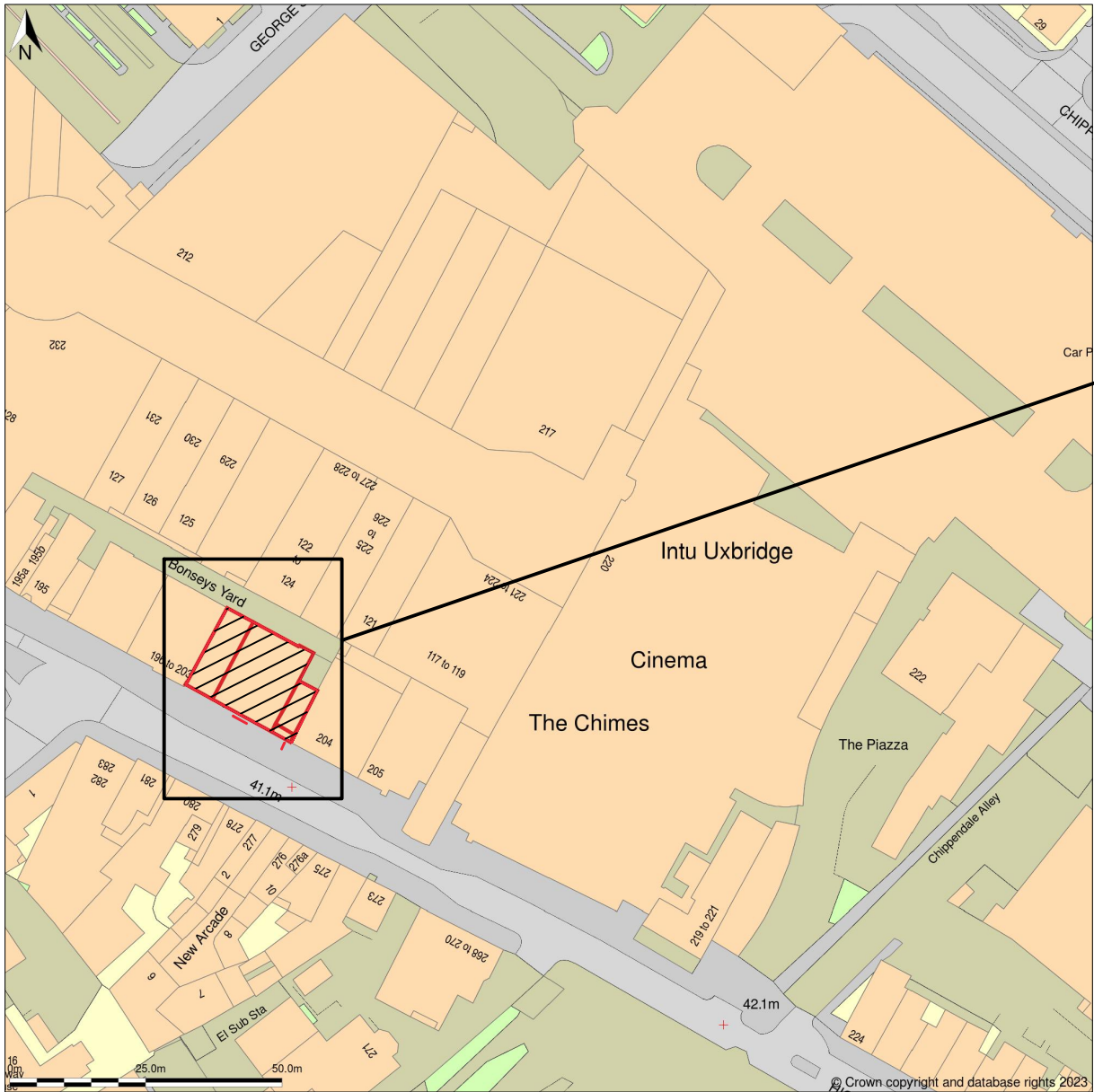
Site Plan Scale 1:1250