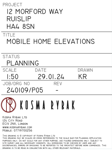
SIDE ELEVATION - EAST