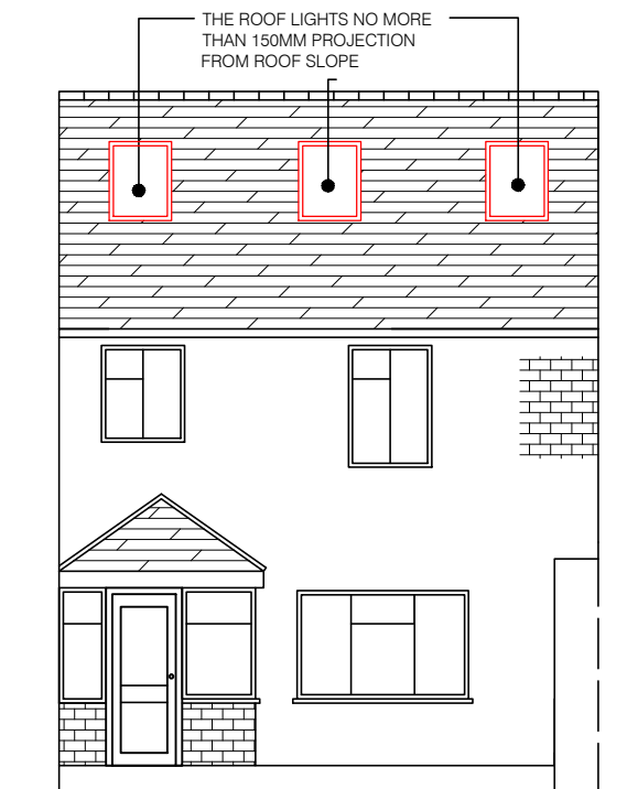
PROPOSED - FRONT ELEVATION