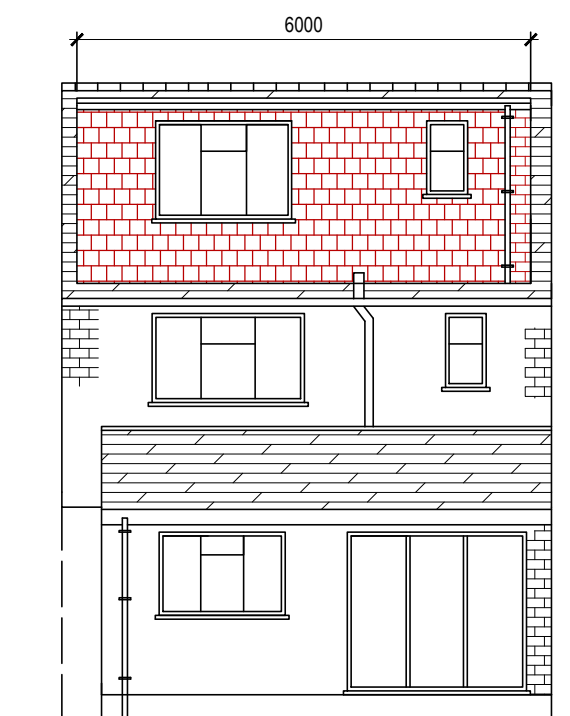
PROPOSED - REAR ELEVATION