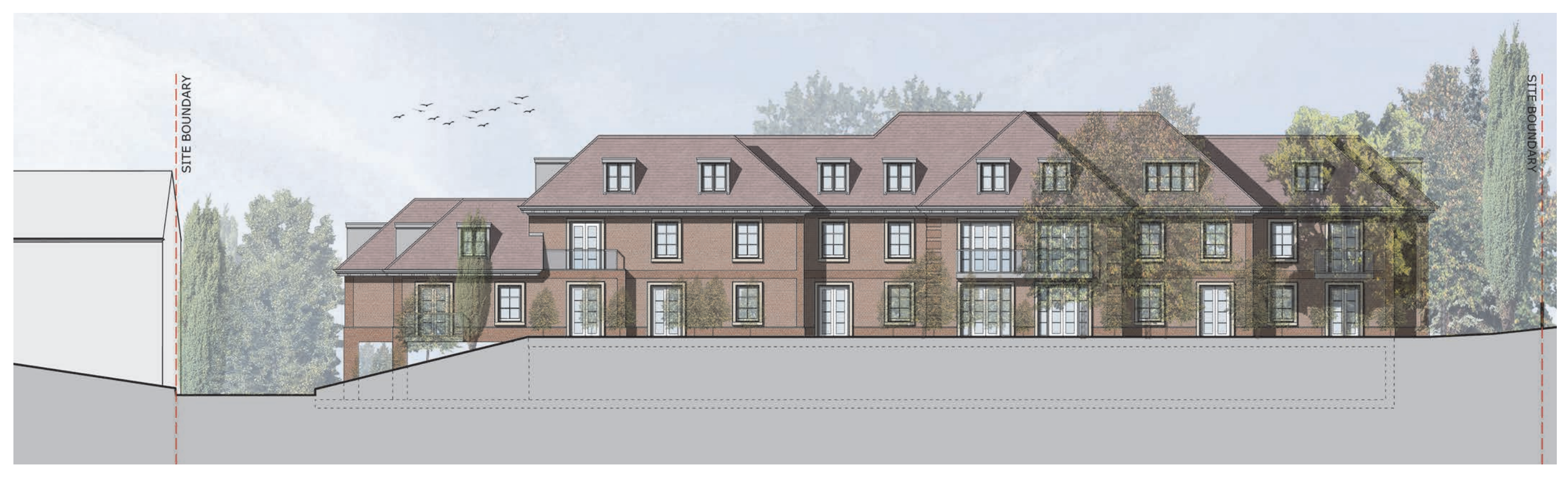
Previously Submitted North East Elevation