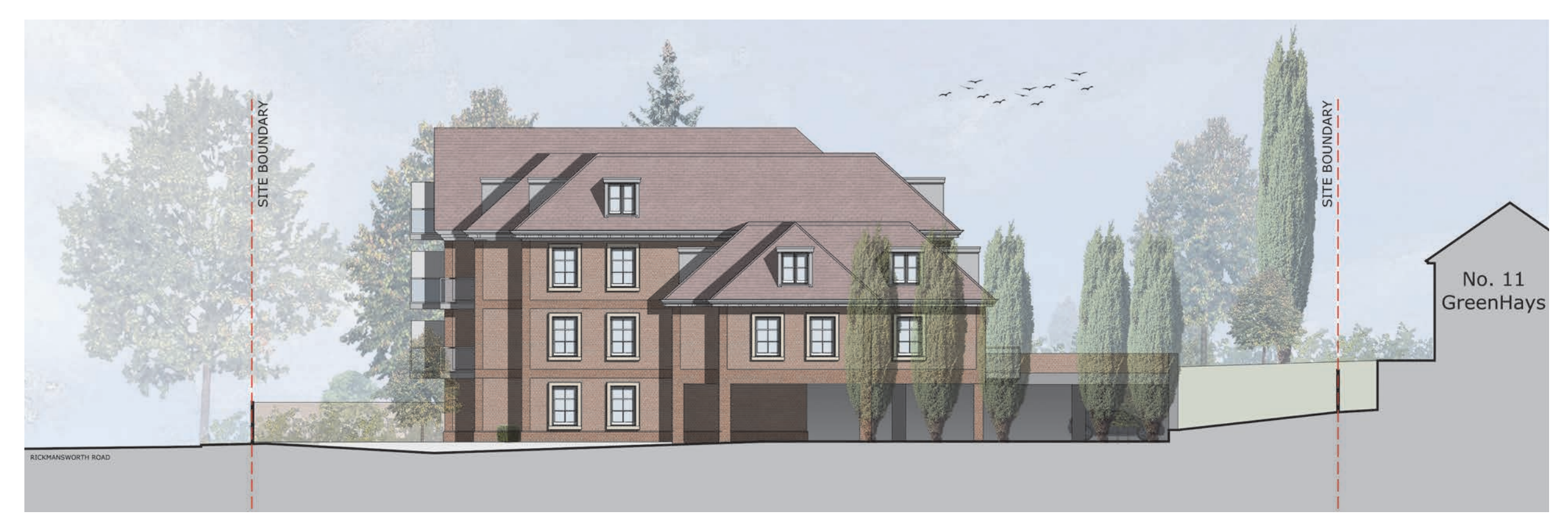
Previously Submitted South East Elevation