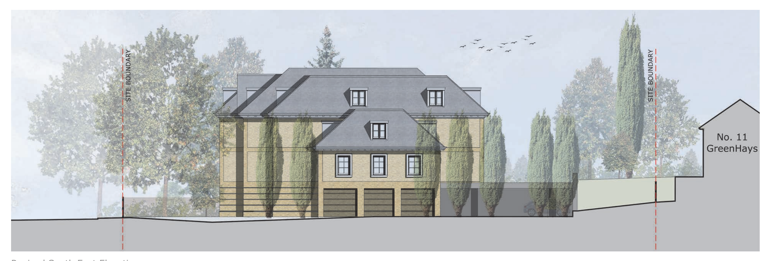
Revised South East Elevation