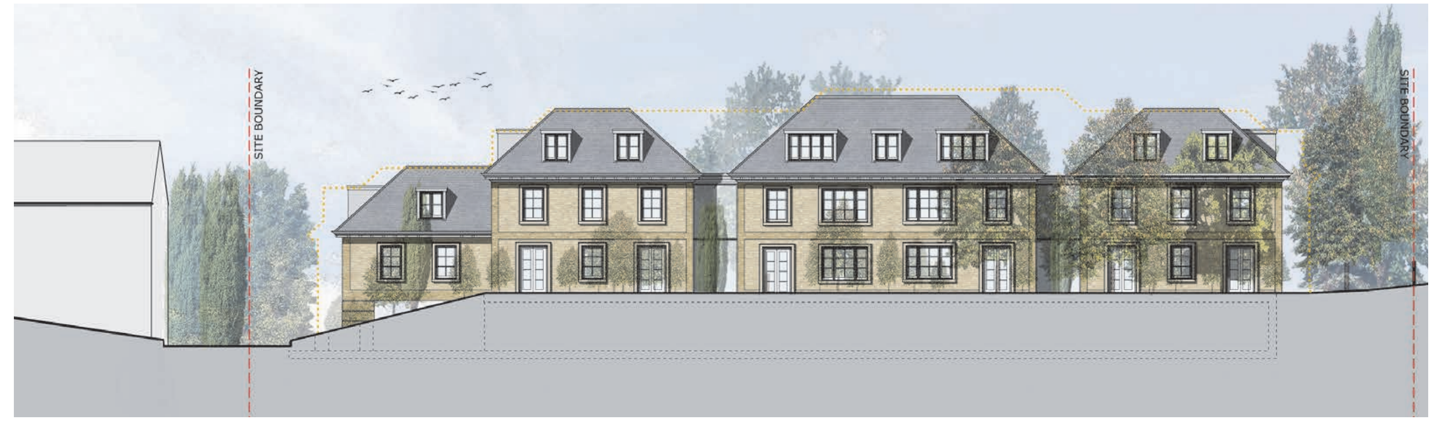
Revised North East Elevation