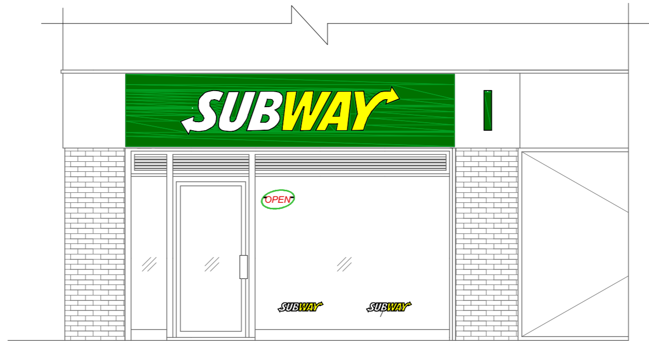
PRE-EXISTING FRONT ELEVATION