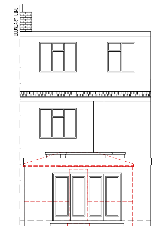
SOUTH- WEST REAR ELEVATION