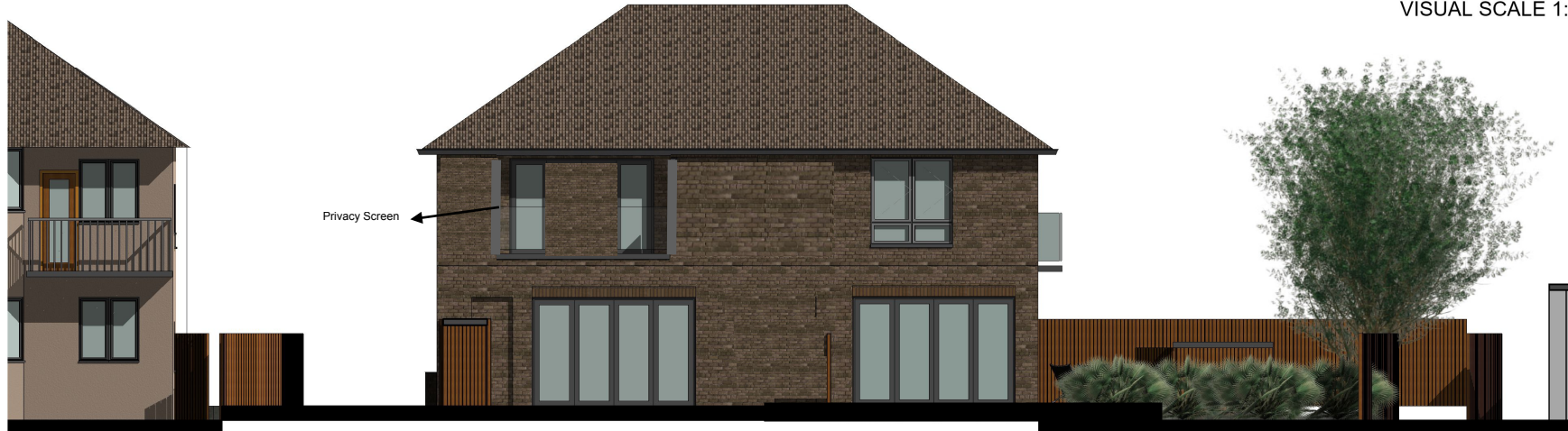
1 North East - Front Elevation