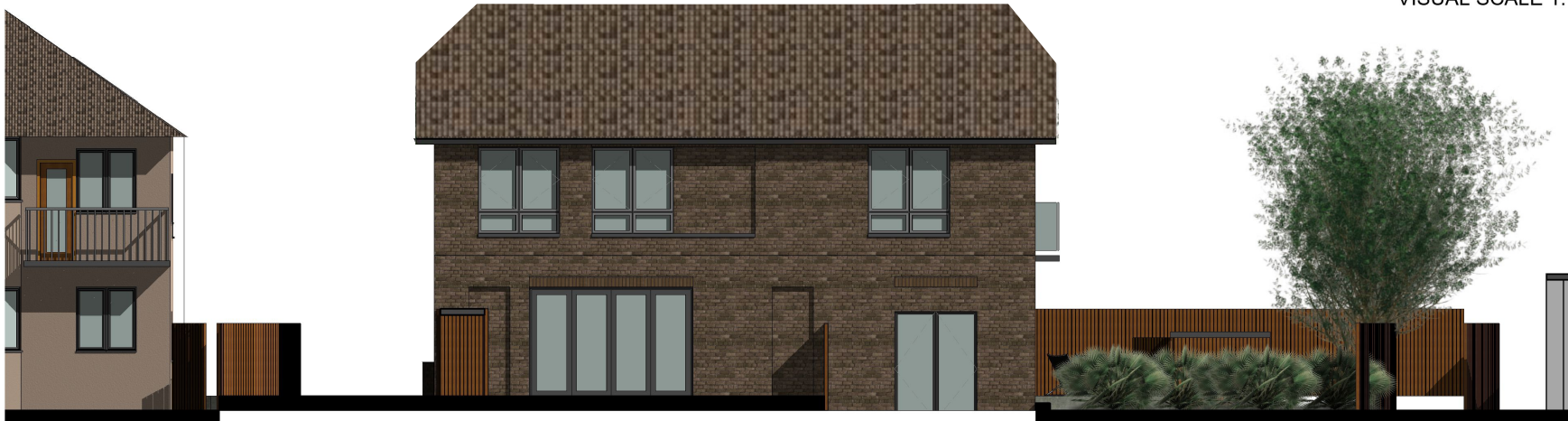
1 North East - Front Elevation