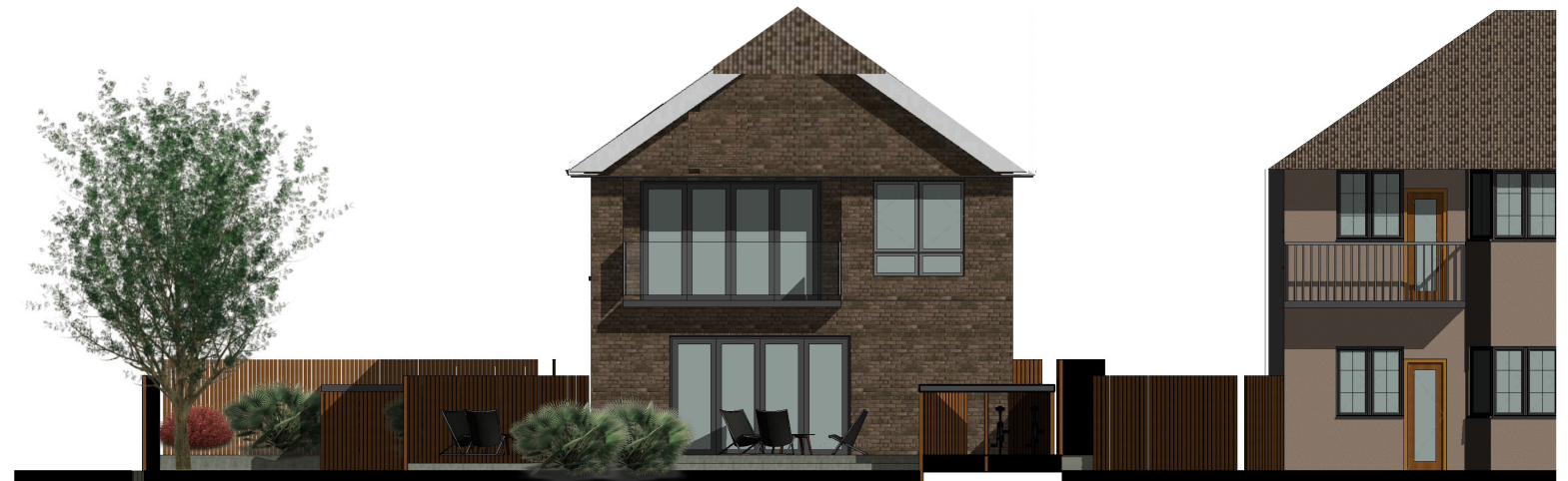
2 North West - Side Elevation