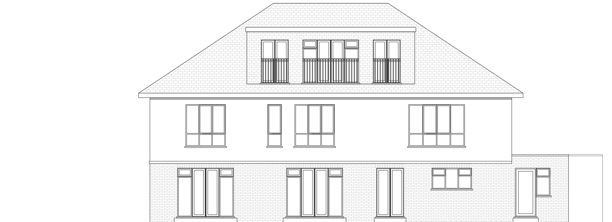
06 Proposed Rear Elevation Scale 1:100