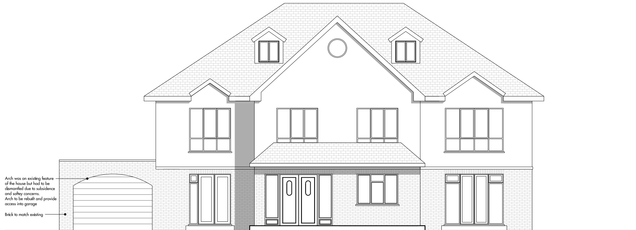
05 Proposed Front Elevation Scale 1:100