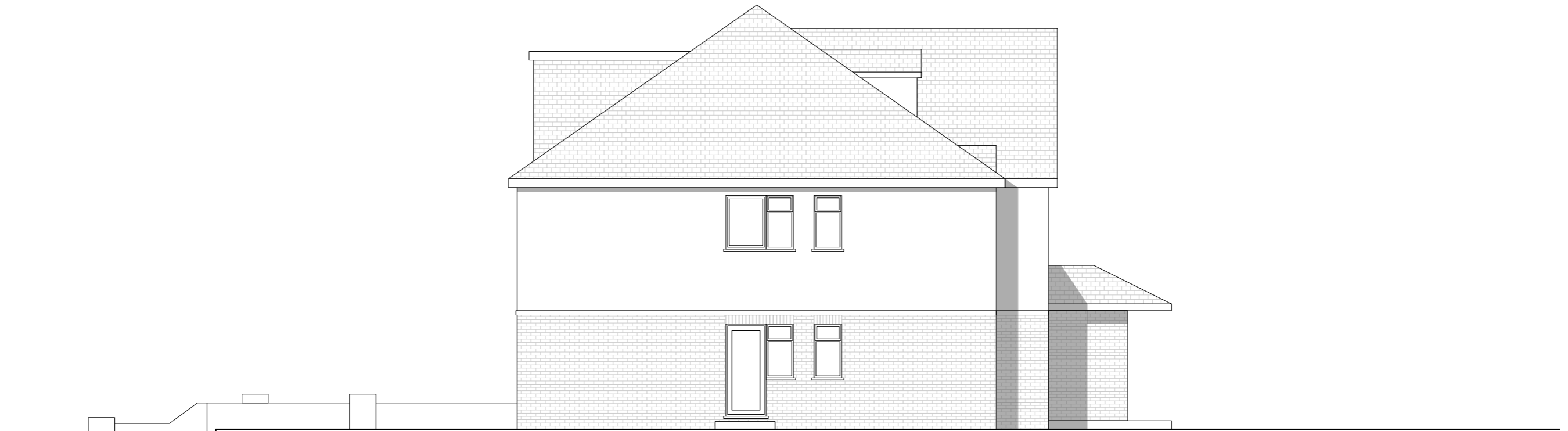
03 Existing Side Elevation (North) Scale 1:100