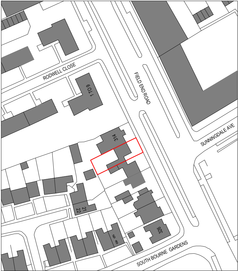
I SITE LOCATION PLAN SCALE : 1 : 1 2 5 0