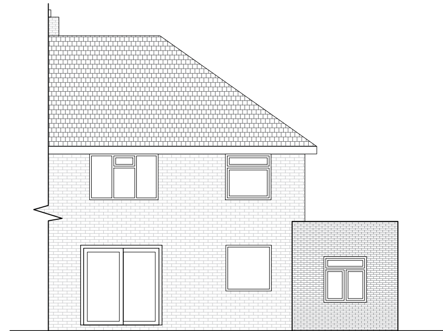
PROPOSED REAR ELEVATION SCALE 1: 100