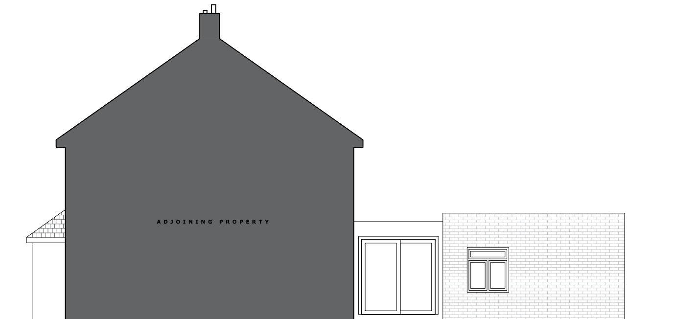
PROPOSED RIGHT SIDE ELEVATION SCALE 1: 100