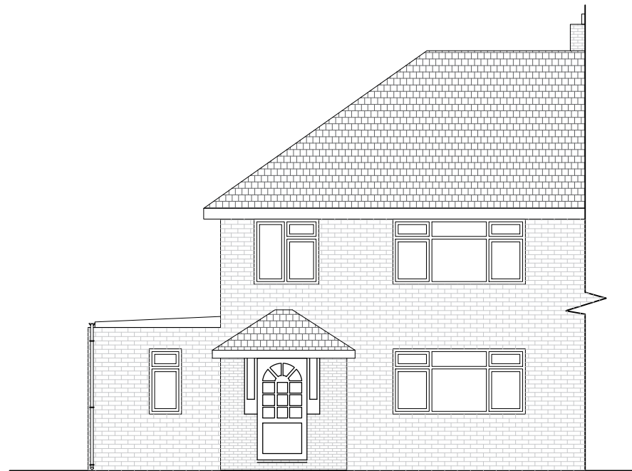
PROPOSED FRONT ELEVATION SCALE 1: 100