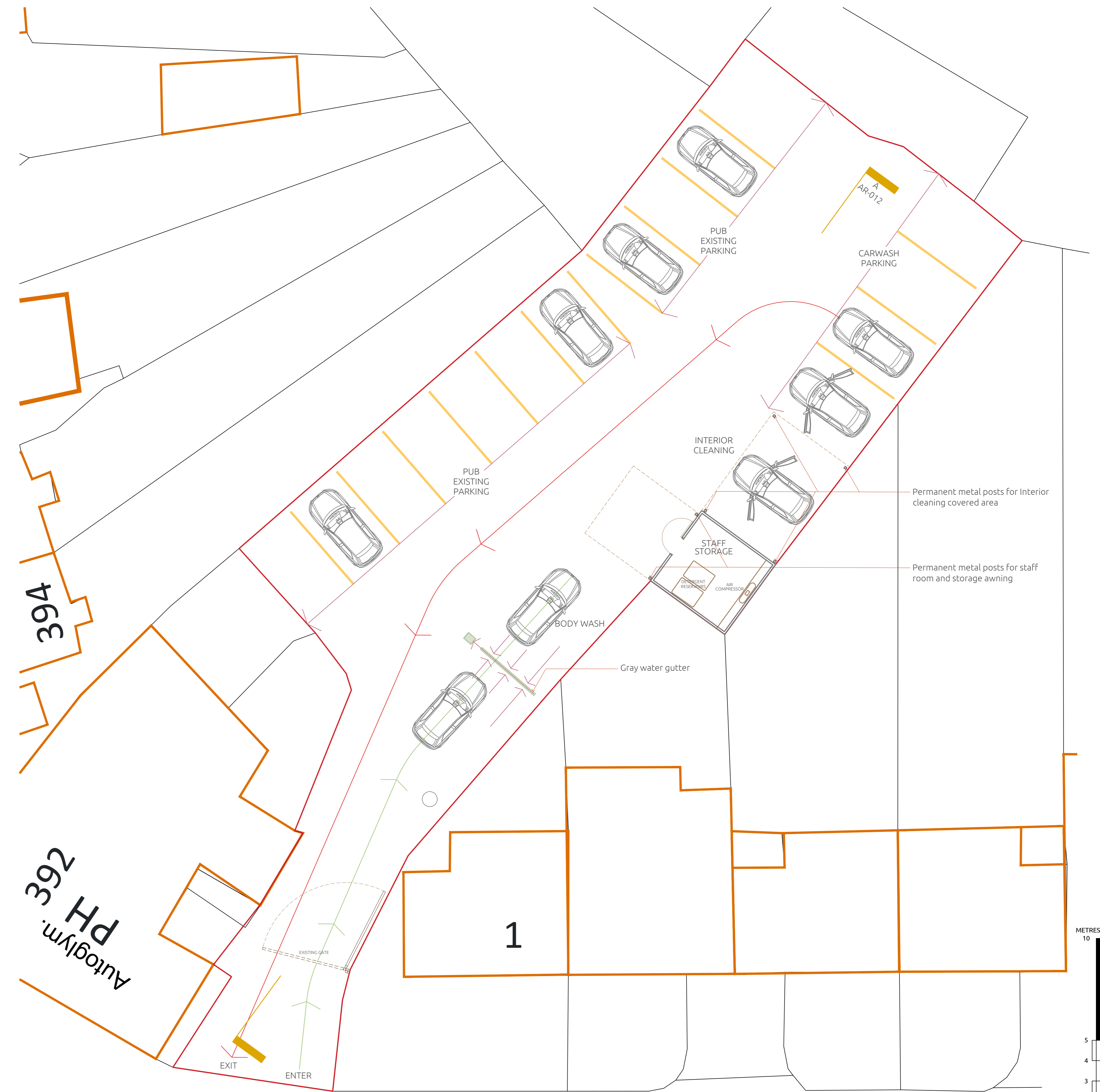
EXISTING Floor Plan Scale: 1 | 100