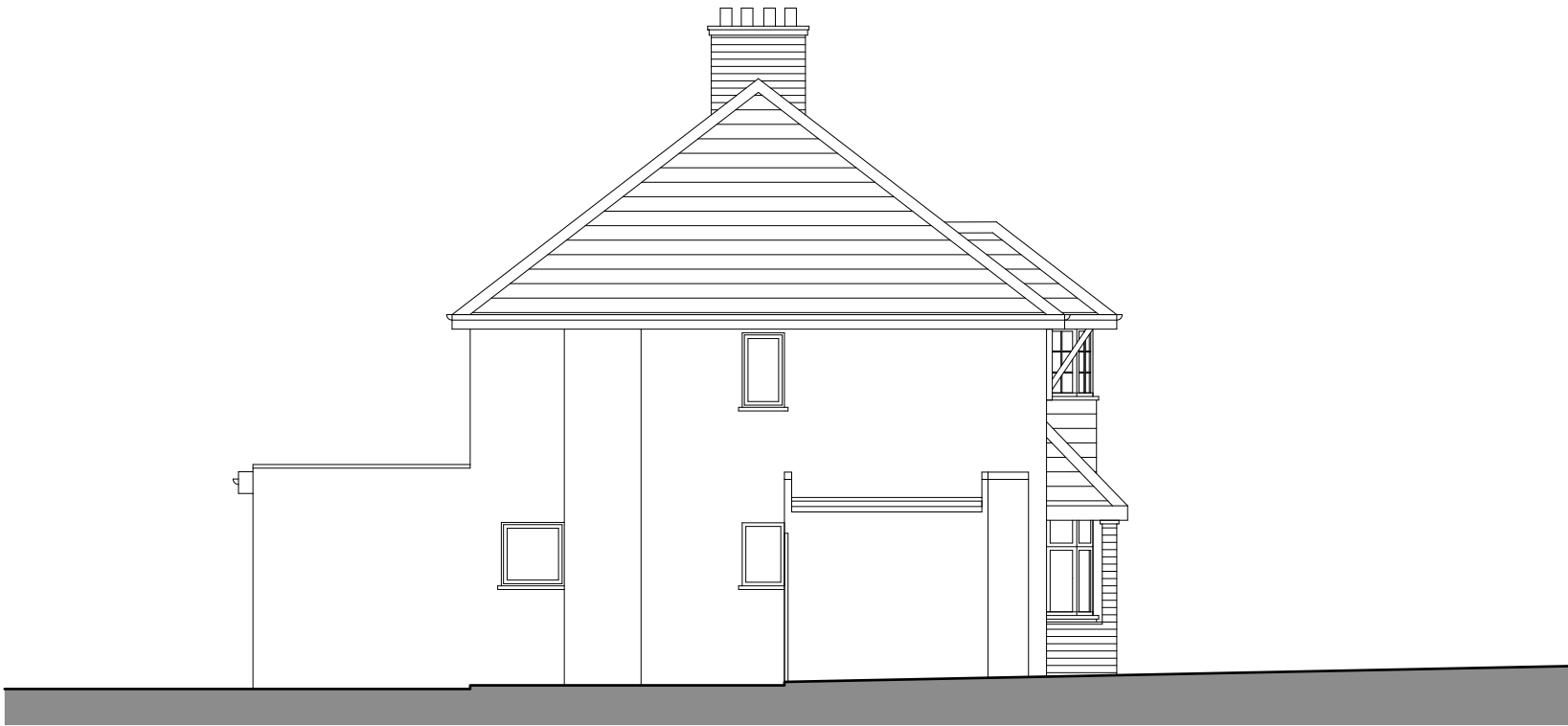
2 WEST - Rear Scale: 1:100