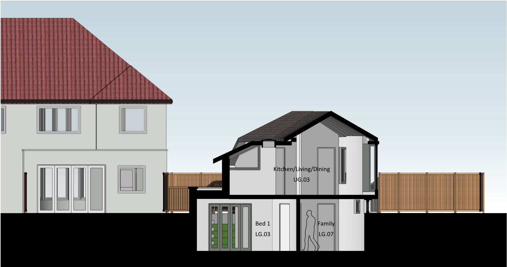
1 SECTION A-A Scale: 1:100