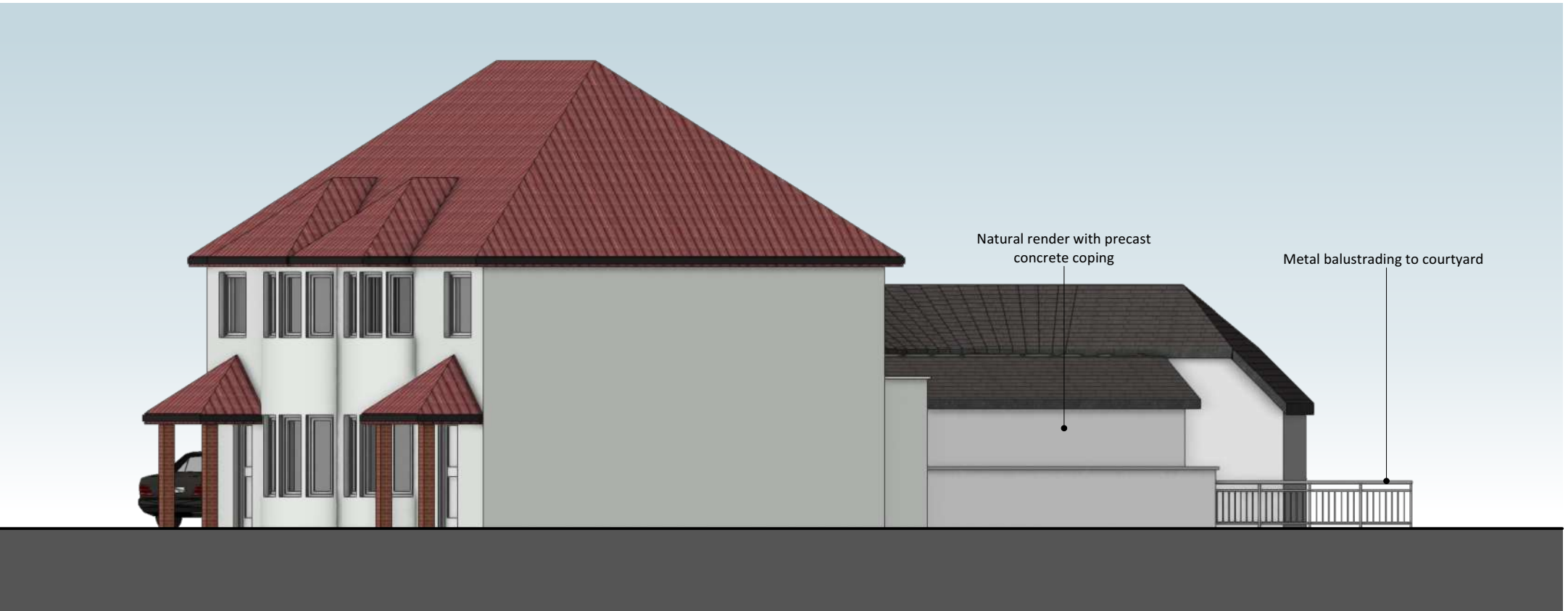
5 NORTH Scale: 1:100