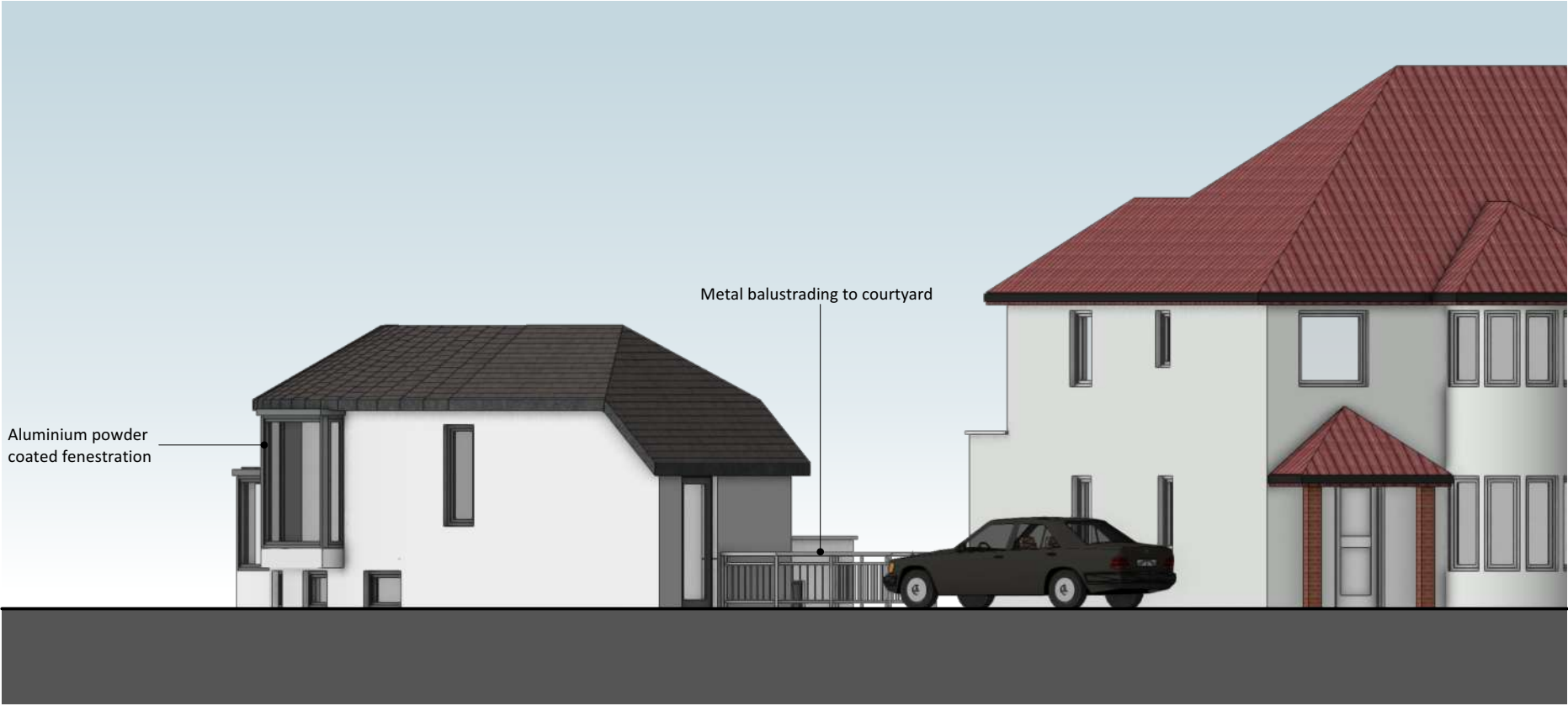
3 EAST Scale: 1:100