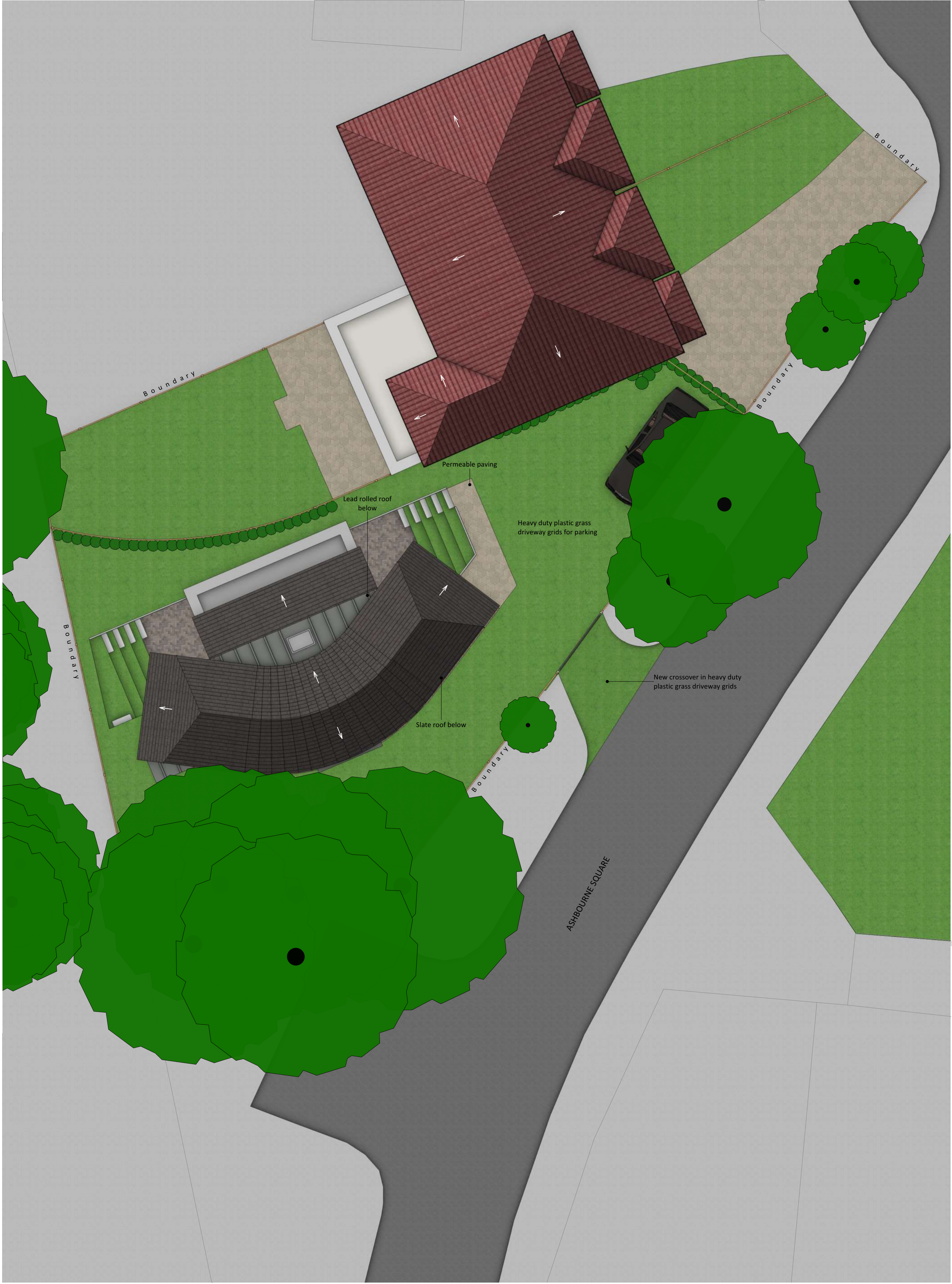
1 ROOF Scale: 1:100