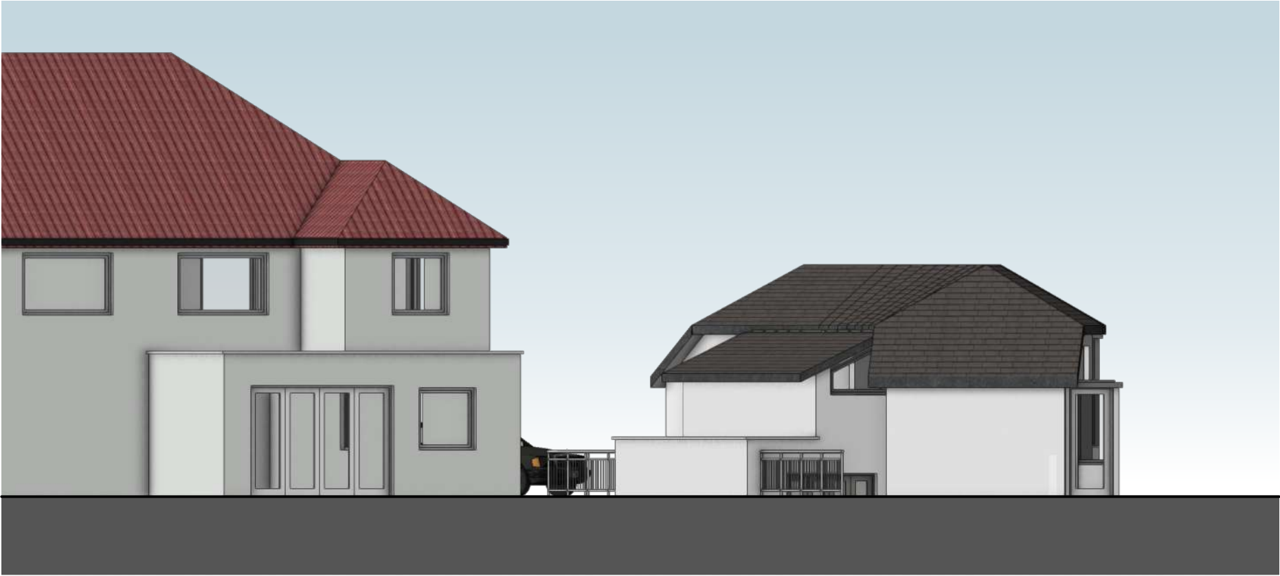
4 WEST Scale: 1:100