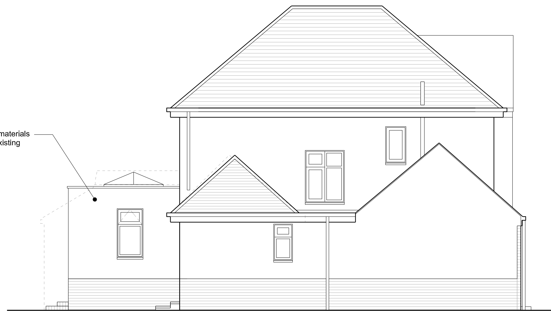
Proposed Side Elevation (West)