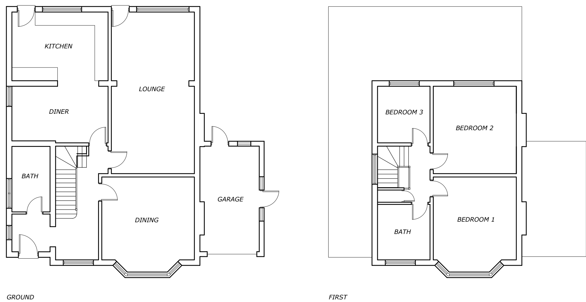
EXISTING FLOOR PLANS