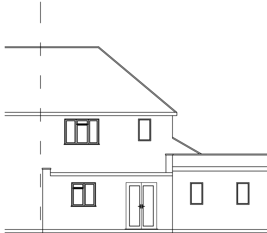
2 Existing Rear Elevation SCALE: 1:100