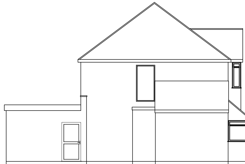
4 Existing Side Elevation SCALE: 1:100