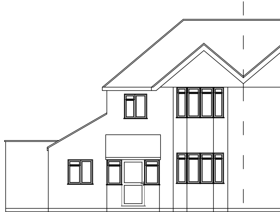
1 Existing Front Elevation SCALE: 1:100