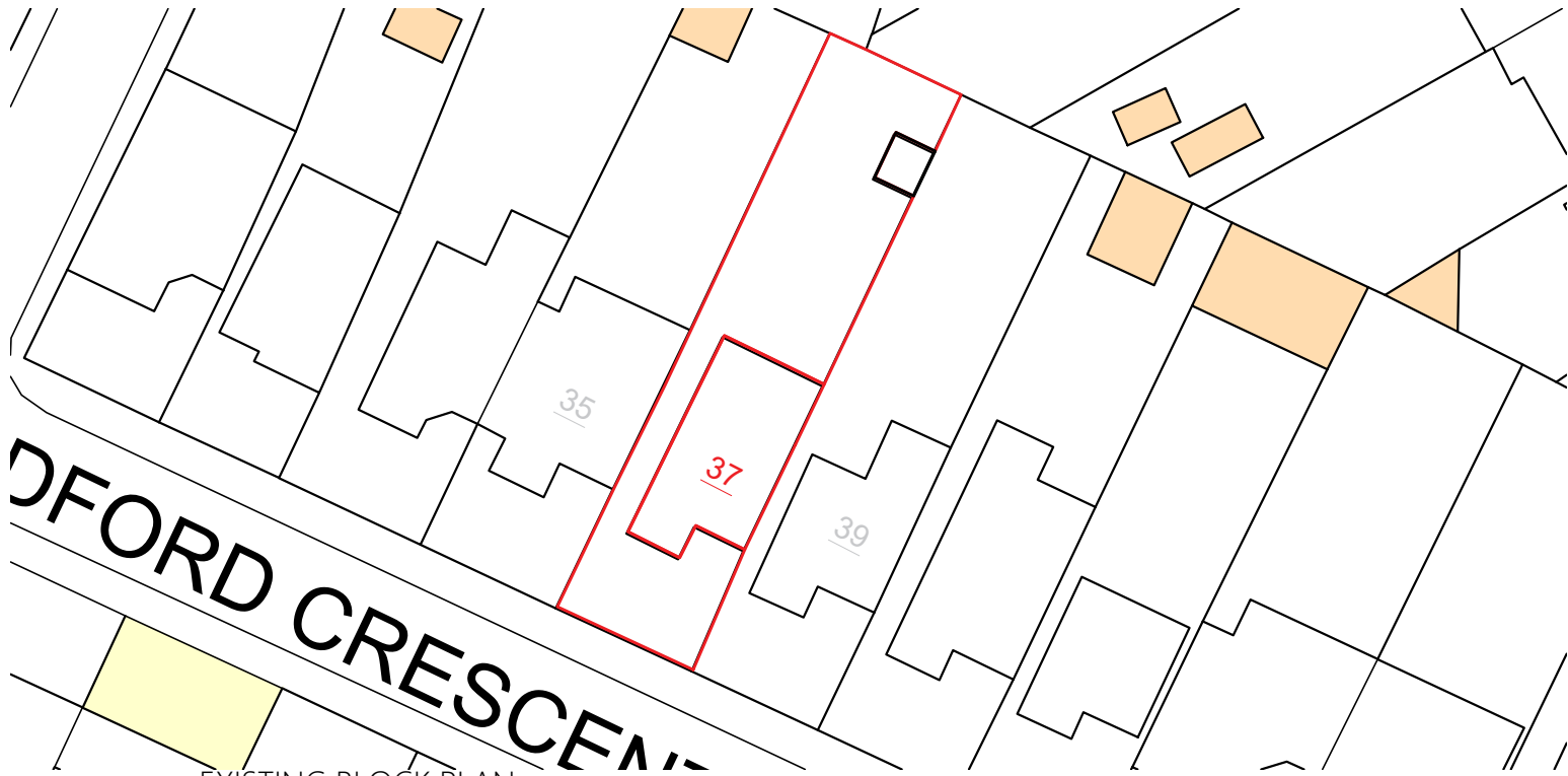
EXISTING BLOCK PLAN scale 1:500