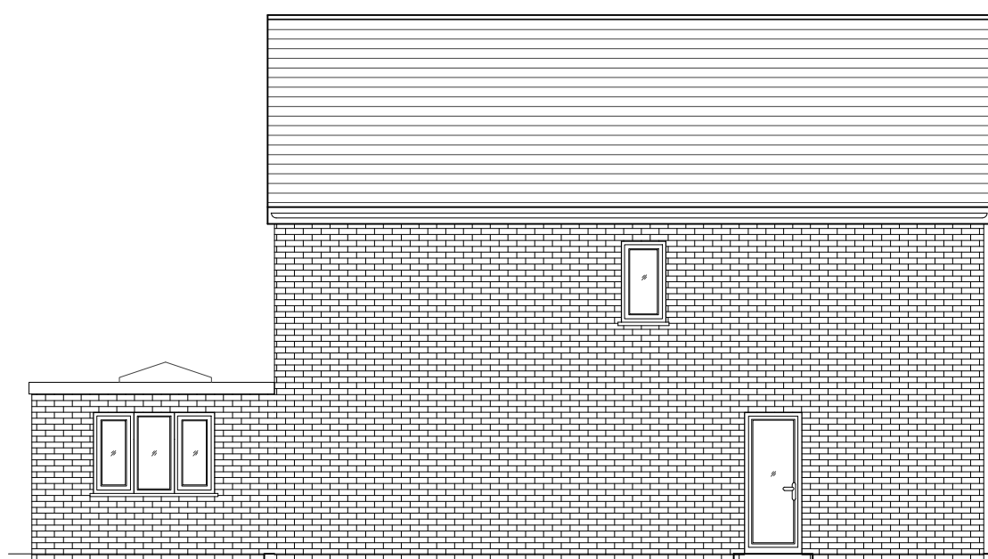
04 - RIGHT SIDE ELEVATION