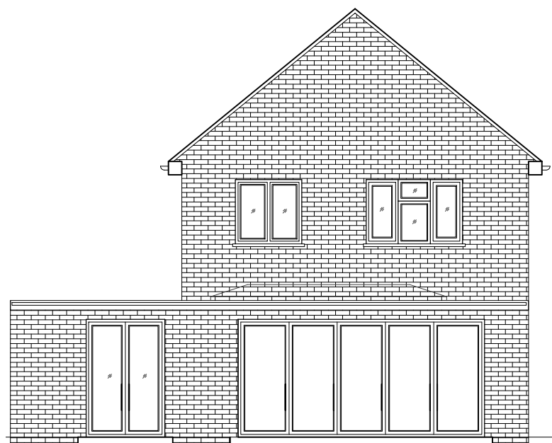
01 - REAR ELEVATION