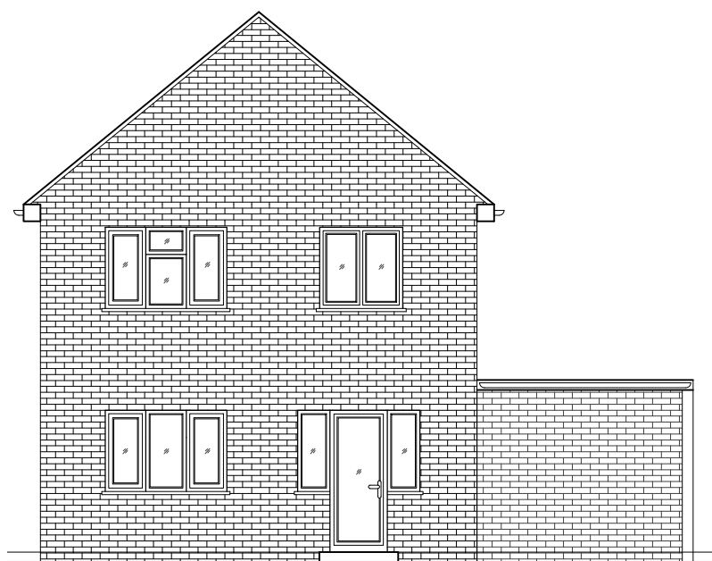
03 - FRONT ELEVATION