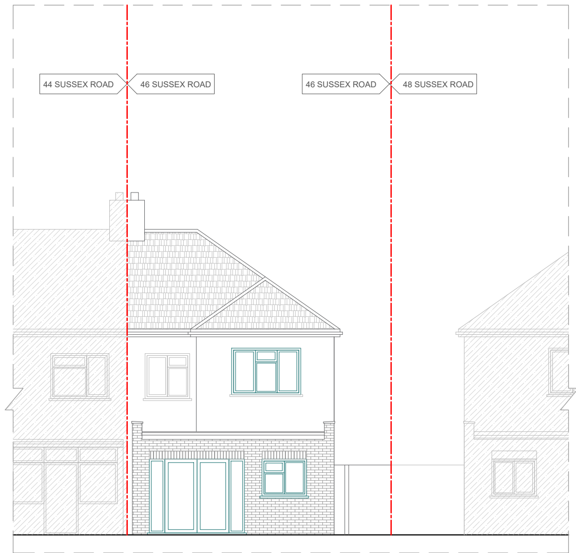
1 EXISTING REAR ELEVATION