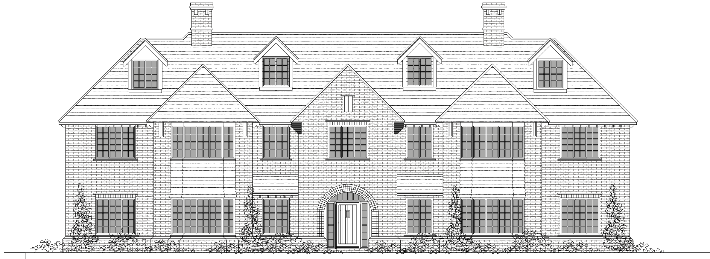
Front (South) Elevation

All Velux windows to be conservation style with vertical glazing bar and to be flush with finished roof surface