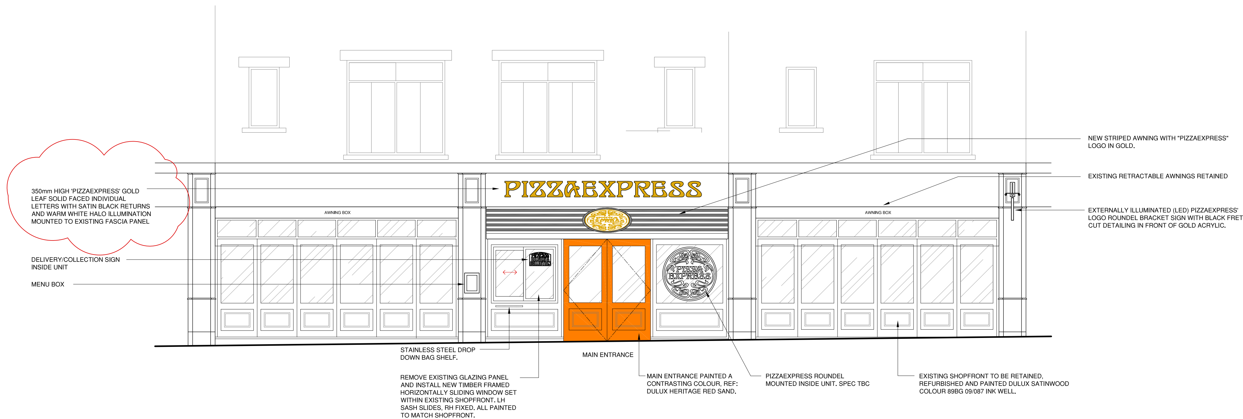
02 11 PROPOSED SHOPFRONT ELEVATION SCALE 1:50