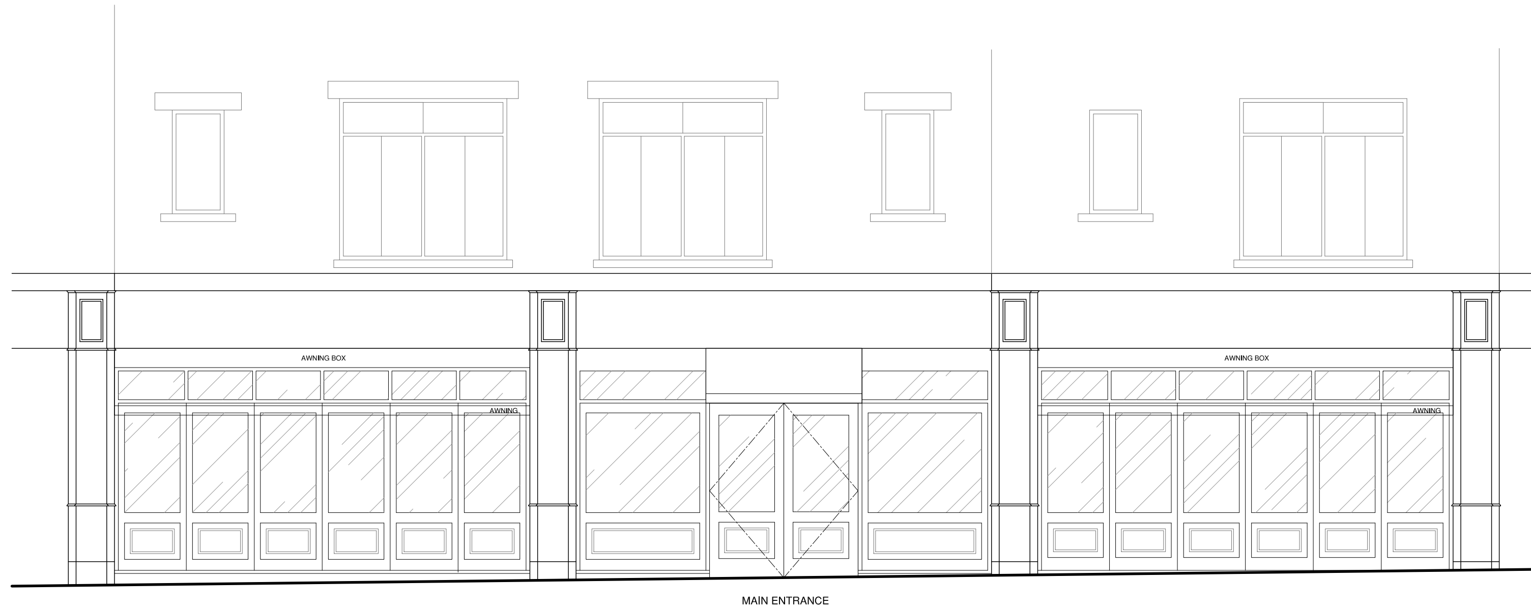
01 11 EXISTING SHOPFRONT ELEVATION SCALE 1:50

NOTES : ALL SETTING OUT MUST BE CHECKED ON SITE ALL LEVELS MUST BE CHECKED ON SITE ALL FIXINGS AND WEATHERINGS MUST BE CHECKED ON SITE ALL DIMENSIONS MUST BE CHECKED ON SITE THIS DRAWING MUST NOT BE SCALED THIS DRAWING MUST BE READ IN CONJUNCTION WITH THE RELEVANT SPECIFICATION CLAUSES THIS DRAWING MUST NOT BE USED FOR LAND TRANSFER PURPOSES ALL REQUIREMENTS OF EDINBURGH AIRPORT LTD'S AIRPORT BEST PRACTICE CONCESSIONAIRE DESIGN AND FIT-OUT MANUAL SHALL BE COMPLIED WITH. © BUTLER ASSOCIATES