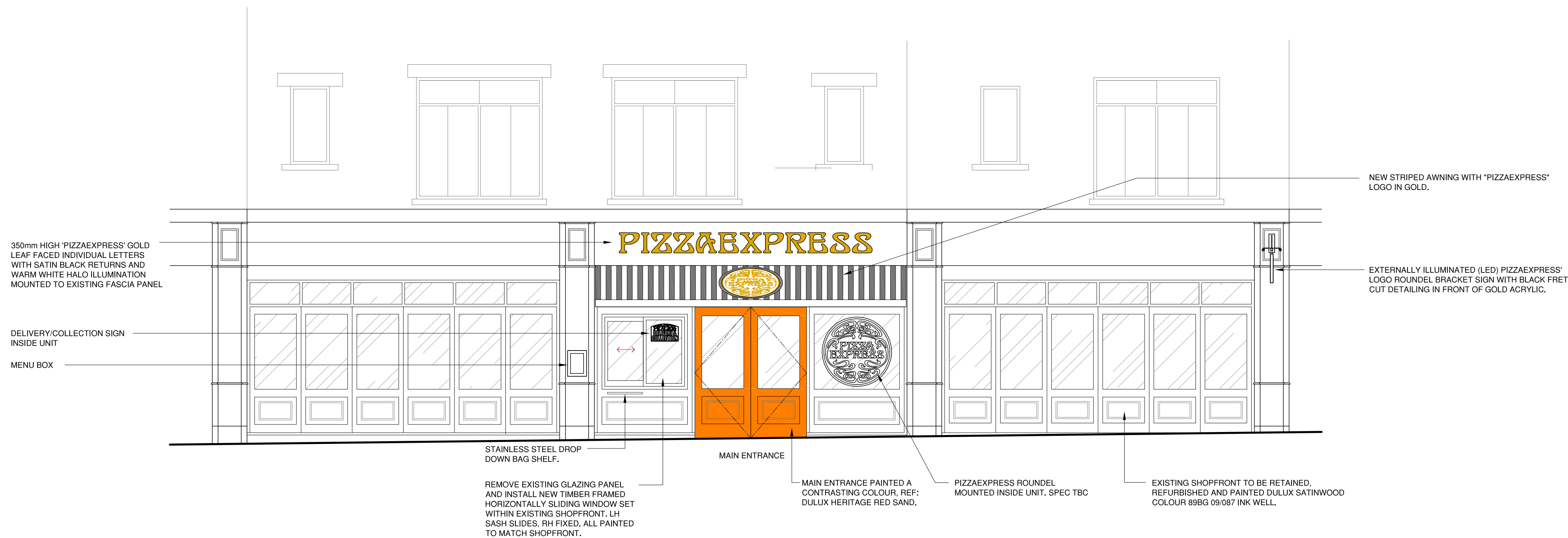
02 11 PROPOSED SHOPFRONT ELEVATION SCALE 1:50