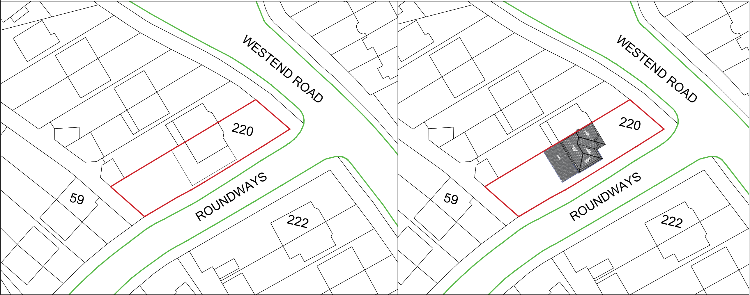
Existing Block Plan