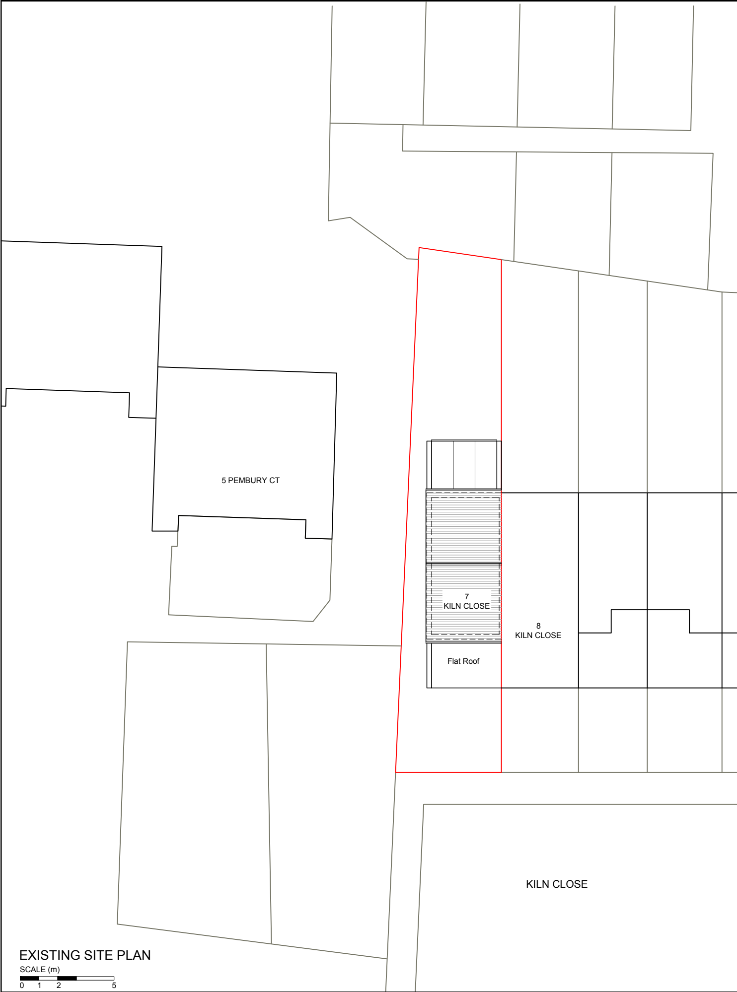
EXISTING SITE PLAN SCALE (m) 0 1 2 5

INFORMATION CONTAINED IN THIS DWG IS CONFIDENTIAL AND MAY NOT BE USED FOR ANY OTHER PURPOSE OTHER THAN THAT FOR WHICH THE DWG WAS SUPPLIED. LA VAASTU MAINTAINS COPYRIGHT OF DWG, AND ACCEPTS NO LIABILITY TO ANY THIRD PARTY RELYING ON INFORMATION CONTAINED IN THE DWG. CONTRACTORS MUST VERIFY ALL DIMENSIONS ON SITE BEFORE COMMENCING ANY WORK OR SHOP DRAWINGS. FIGURED DIMENSIONS ARE TO BE USED IN PREFERENCE TO SCALED DIMENSIONS. IF THIS DRAWING EXCEEDS THE QUANTITIES TAKEN IN ANY WAY THE ARCHITECTURAL DESIGNER IS TO BE INFORMED BEFORE THE WORK IS INITIATED.