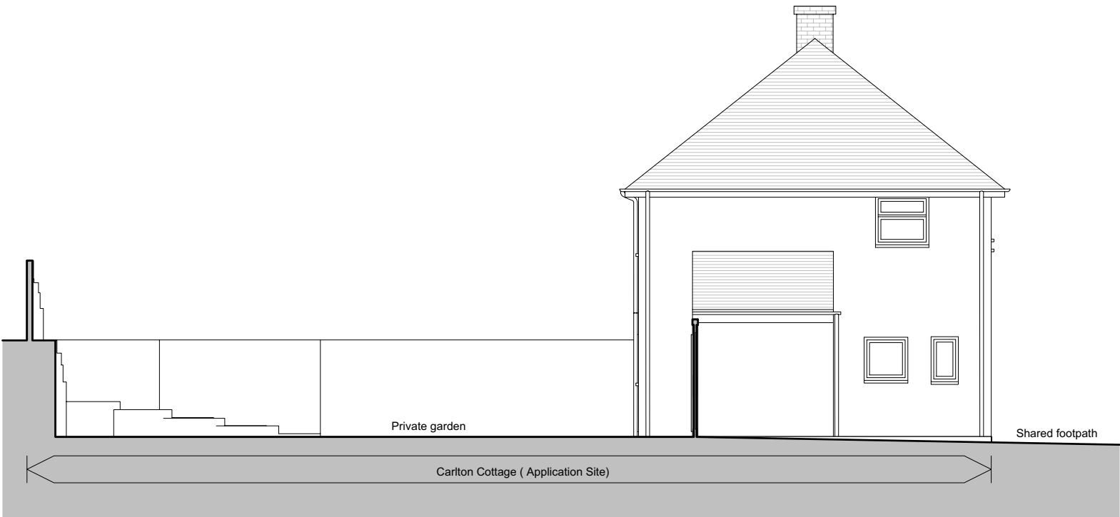
6 Existing Elevation CC (Side) Scale: 1:100