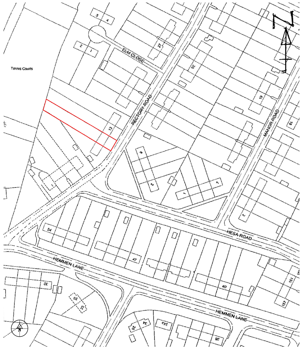
01 - OS MAP SCALE 1:1250