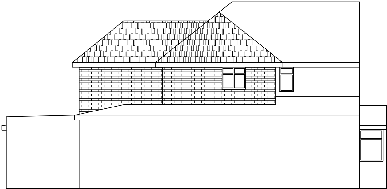
PROPOSED SIDE ELEVATIONS