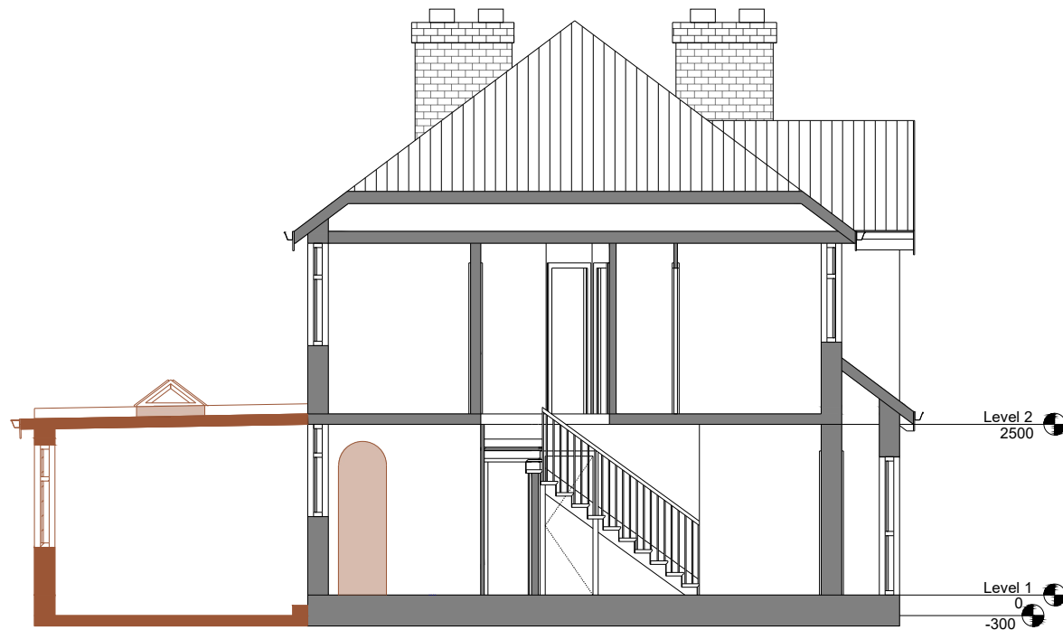
PROPOSED SECTION SCALE: 1:100