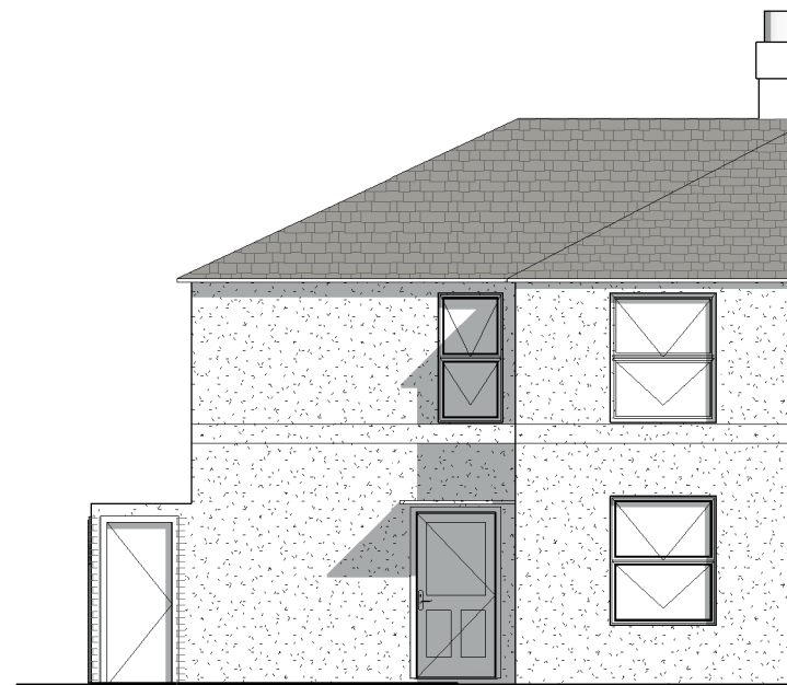
1 EAST ELEVATION 1 : 100

All dimensions are in millimeters unless noted otherwise. All dimensions to be verified on site. For any discrepancies and omissions, it is recipient's responsibility to verify the same specifically with the designer. The copyright of this drawing is held by MuHu Architecture. No unauthorized use or copies are permitted without our consent.