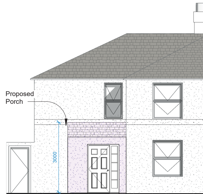
2 EAST ELEVATION 1 : 100

All dimensions are in millimeters unless noted otherwise. All dimensions to be verified on site. For any discrepancies and omissions, it is recipient's responsibility to verify the same specifically with the designer. The copyright of this drawing is held by MuHu Architecture. No unauthorized use or copies are permitted without our consent.