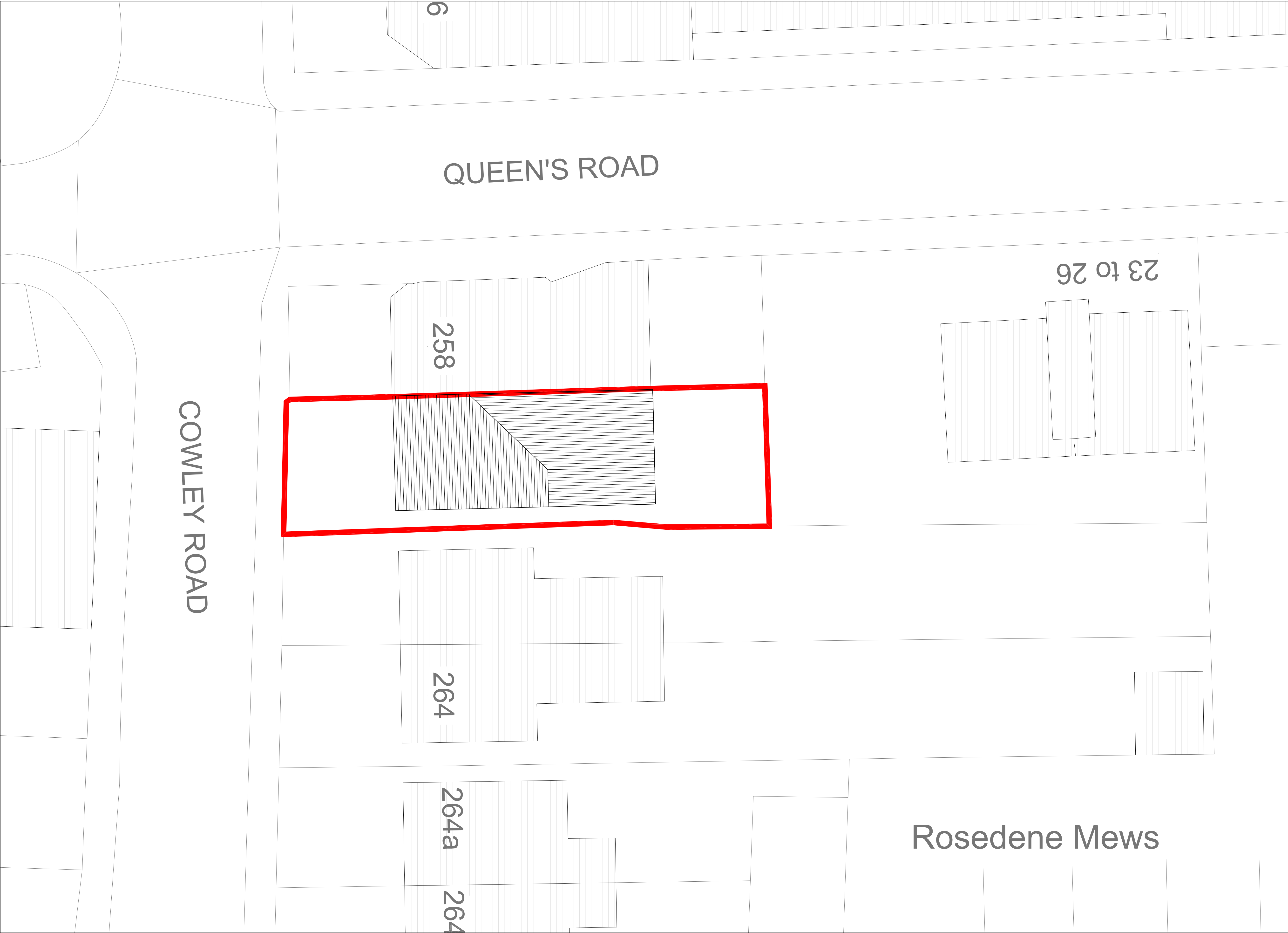
PROPOSED BLOCK PLAN SCALE 1:100