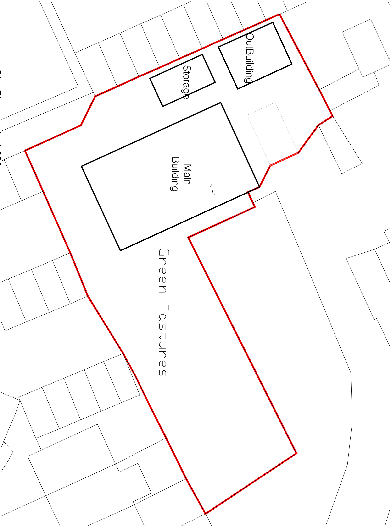
Site Plan scale 1:200