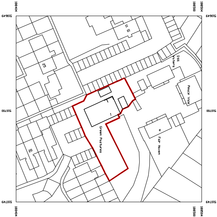
Location Plan scale 1:1250