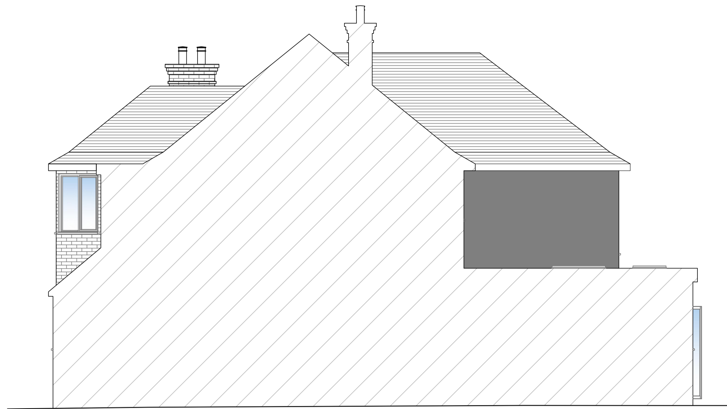
02 005 1:50 PROPOSED RIGHT SIDE ELEVATION